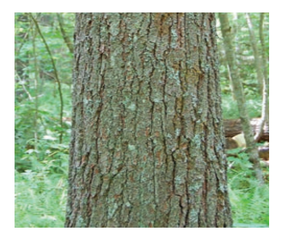
White pine bark

be identified by their jigsaw puzzle-like bark and needles in bundles of two. Under natural conditions, red pine is far less common then white pine, growing mostly on well drained sites with nutrient poor soils and a history of fire.