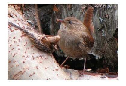
Winter wren