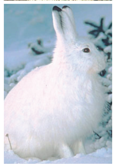
Snowshoe hare in summer (top) and winter (bottom) coloring