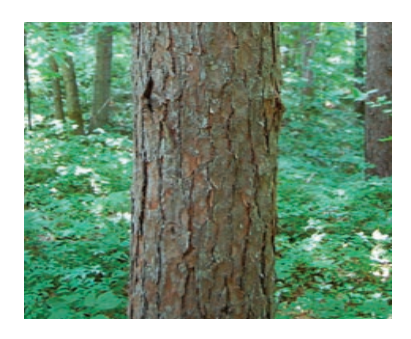
Red pine bark