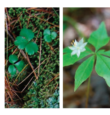
Goldthread (left), starflower (right)