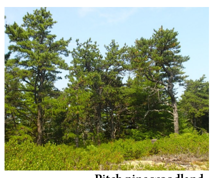
Pitch pine woodland.

infrequent. Today, pitch pine communities persist only on certain dry outcrops or outwash sand barrens. These habitats and the species that specialize upon them are now very rare in Maine. Pitch pine woodlands are characterized by having a sparse canopy of pitch pine with a dense understory of heath shrubs including black huckleberry (Gaylusaccia baccata), lowbush blueberry (Vaccinium angustifolium), rhodora (Rhododendron canadense) and sheep laurel (Kalmia angustifolia). Pitch pine woodlands are important habitat for many species of wildlife including several rare butterfly and moth species.