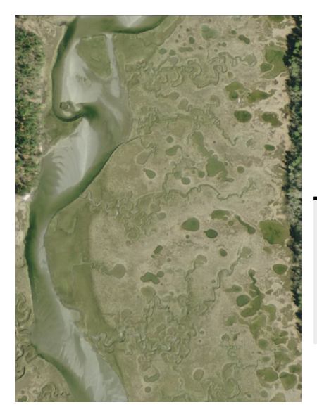
Natural pools and channels within the little river salt marsh. A recent study shows that marshes not impacted by ditching may be more resilient to impacts of sea level rise.