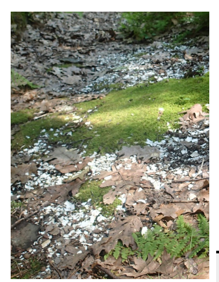
Shells on the forest floor, evidence of nature's litterbugs—racoons.