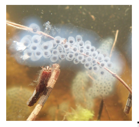
Spotted-salamander egg mass, submerged in a vernal pool.