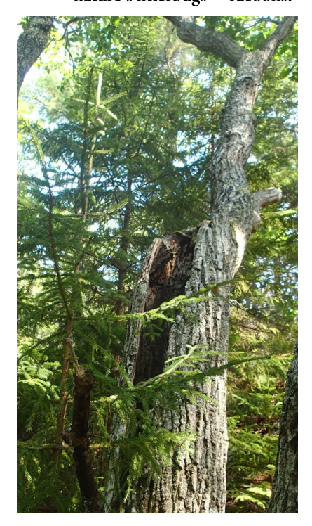
Large tree cavities are uncommon in Maine forests, but provide valuable feeding and nesting habitat for a variety of species.