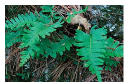
Polypody grows on cliffs, boulders and other rocky habitats.

sheet melted, retreating inland from the Maine coast, the sea was as much as 150 feet above present levels, relative to land. Upland areas, such as those along the Little River Trail, became coastal headlands and islands during this period, regularly washed and eroded by intense wave action. Relieved of the weight of the ice sheet, the land mass slowly rebounded over thousands of years and sea level dropped to its present elevation. Geologists call this process 'isostatic rebound'. In low lying areas, fine sediments deposited on the seafloor were now exposed (clay soil), and islands and headlands in areas exposed to wave action were now further from the shore and today exist as exposed and rocky uplands. These processes shape natural communities that occur all along the Little River Trail.