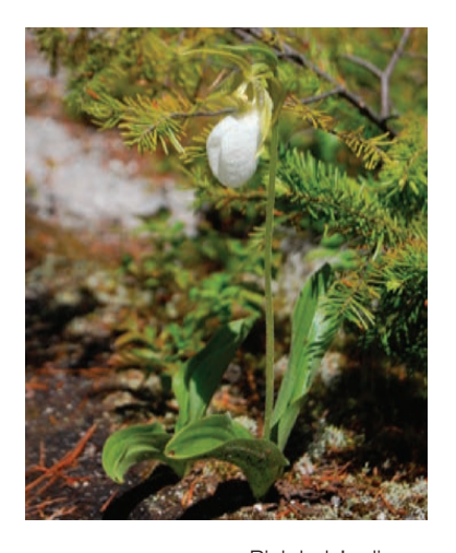
Pink lady's slipper