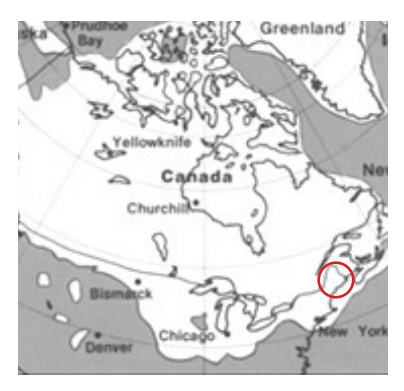
The maximum extent of glacial ice during Pleistocene time (2 million years ago to 10,000 years ago) Map courtesy of the USGS