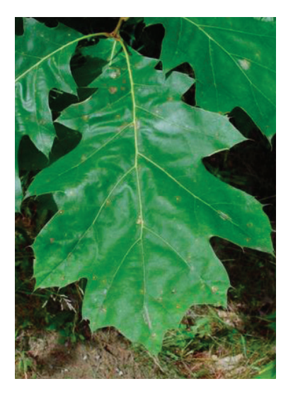
Red oak leaf