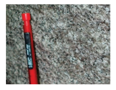
Granite exposure at Sanders Hill