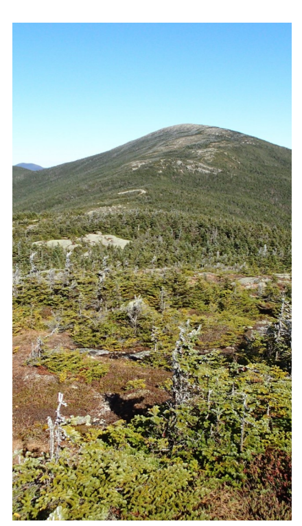
View from The Horn across Saddleback's alpine ridge.

fresh human consumption, but have been used to make jams and wines.