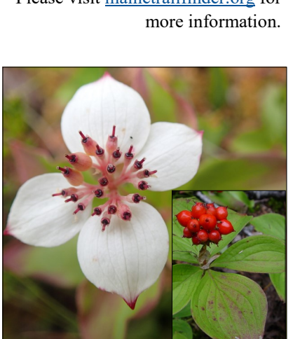
Bunchberry flowers and fruits. These berries are consumed by a variety of wildlife species including deer, moose, grouse and many others.

To reach the trailhead, turn off ME-4 in the center of Madrid village and cross the Sandy River over the one-lane bridge onto the paved Reeds Mill Road. At 3.0 miles, immediately after crossing a bridge over Conant Stream in front of a white house (on the right), turn left onto a gravel road. Follow this private gravel road, for 3.1 miles until the road forks. Take a left at the fork and, shortly after crossing a bridge, you will arrive at an ATV gate. Park at the ATV gate and hike for approximately 1.4 miles along an ATV Trail before meeting the Berry Picker' trail. Navigational guides and a vehicle with good clearance are strongly advised. Please visit mainetrailfinder.org for