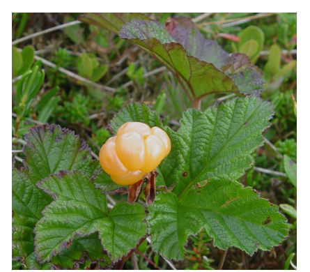
Cloudberry plants make a single fruit each year with a distinctive, tart