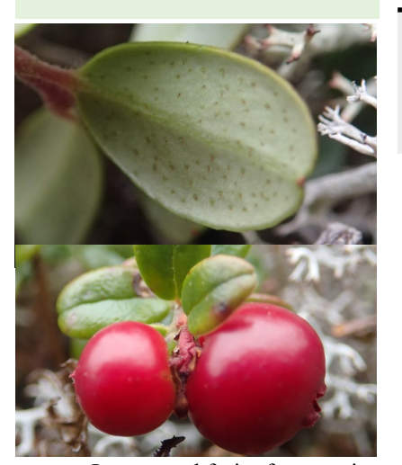
Leaves and fruit of mountain cranberry.

Mountain cranberry (Vaccinium vitis-idaea) is distinguished from small cranberry (Vaccinium oxycoccos) by the presence of dark glands on the underside of the leaves.