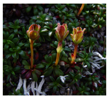
Fleshy leaves and mat forming growth patterns help cushion-plant ( Diapensia lapponica ) grow in difficult alpine conditions.