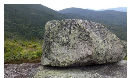
Glacial erratic on the south slope of Saddleback Mountain.

Emerging onto a rocky outcrop, we gain the first of a series of exceptional views of the surrounding mountains and valleys. Scattered red spruce and balsam fir are gaining purchase in cracks in the rock. Closer to the ground we see the process of soil creation, with mosses and lichens growing on moist seeps on the rock face, soon to be colonized by a variety of low shrubs including the common lowbush blueberry ( Vaccinium angustifolium ), velvetleaf blueberry ( Vaccinium myrtilloides ) and uncommon three-tooth cinquefoil ( Sibbaldiopsis tridentata ). Three-tooth cinquefoil is characteristic of these mid-elevation rocky ridges and often grows vegetatively through thin soils and crevices. Although in the rose family, three-tooth cinquefoil does not produce an edible fruit. Instead, its seed is held in a papery receptacle swept away by passing animals.