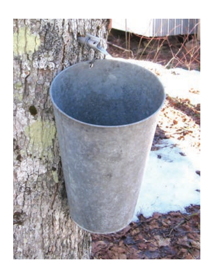
Tapped maple tree with sap bucket hanging from tap

(the largest). After the glaciers melted, plants colonized the till and aided in the development of a covering of soil.