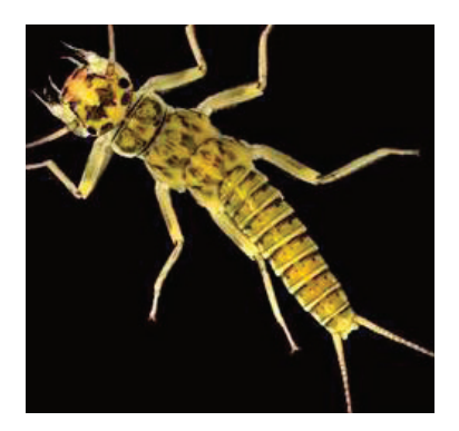
Stonefly nymphs usually have two "tails"