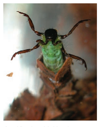
A caddisfly larva inhabits a long, narrow case built of tiny sticks or stones Macroinvertebrate images courtesy of the North American Benthological Society