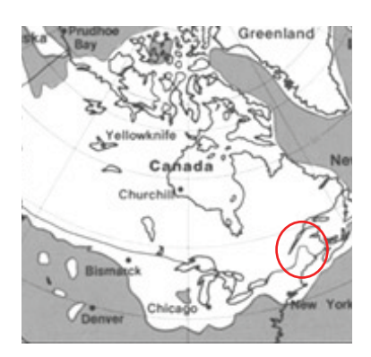
The maximum extent of glacial ice during Pleistocene time (2 million years ago to 10,000 years ago)

Safety Note on Roads: Houghton and Bemis Roads are logging roads. Logging roads may require four-wheel drive and may not be appropriate for small cars or cars with low clearances. Be sure to park on the side of the road where you will not block traffic. Logging vehicles always have the right of way.