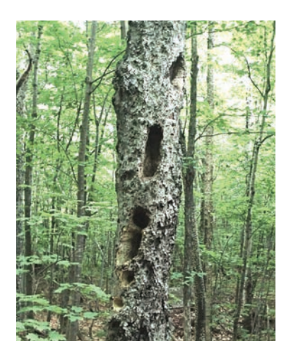
Pileated woodpecker holes in a diseased beech tree

How would you describe this stream? It's relatively shallow and wide, without steep banks. It flows down a gentle slope and the largest rocks in the streambed are about the size of suitcases. Together, these observations paint a picture of a relatively slow,