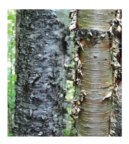
Dull, grayish white bark of a paper birch (left) beside glossy, golden bark of a yellow birch (right)

Downstream of here, Mountain Brook feeds into Berdeen Stream as one of its tributaries. Eventually, the water in Berdeen Stream enters the Swift River, then the Androscoggin River and the Kennebec River, finally entering the Atlantic Ocean at the Gulf of Maine.