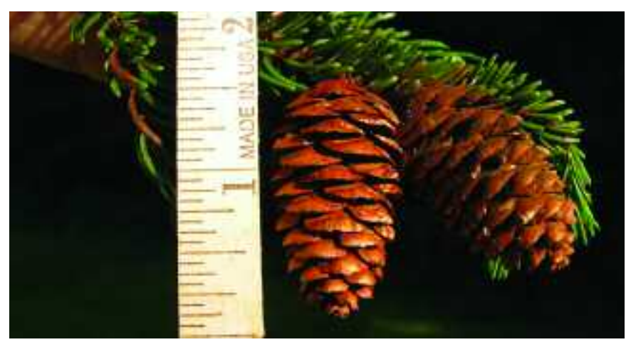
MAINE REGISTER OF BIG TREES 2008 Red Spruce Circumference: 103" Height: 87' Crown Spread: 35' Location: T15 R9 WELS