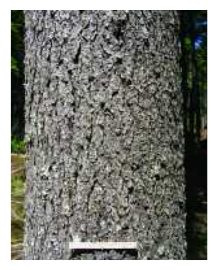
Red spruce is the characteristic tree of the "Acadian forest" of northern New England and the Canadian Maritimes.

Red spruce is one of our most valuable trees for the production of building lumber. It is used for joists, sills, rafters, pilings, weir poles and heavy construction timbers. It is a principal wood used in the manufacture of paper pulp, and is valuable for the sounding boards of musical instruments. Pitch for spruce gum is obtained largely from this tree.