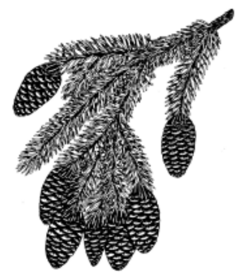
Red spruce is one of our most valuable trees for the production of building lumber.

Red spruce is commonly found throughout the state. It grows on well-drained, rocky upland soils, and particularly on the north side of mountain slopes where it may be the major species present. The spreading branches form a somewhat conical, narrow head in young trees. The trunk is long, with a slight taper. It grows to considerable size, and is capable of attaining a height of 60–80 feet and a diameter of 1–2 feet, but occasionally exceeds these measurements. Red spruce is shadetolerant and will become established in the understory of mixed stands.