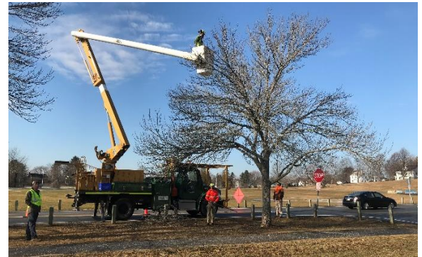
Branch sampling of an ash tree