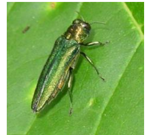
Emerald ash borer adult

For More Information contact: forestinfo@maine.gov or (207) 287-2791