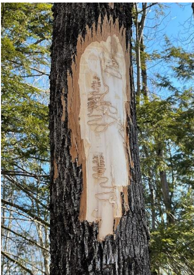
Maine peeled ash tree showing emerald ash borer damage

Although you cannot control the arrival of emerald ash borer on your property, you can decide what impact emerald ash borer will have by developing an emerald ash borer plan. This should be done regardless of proximity to known emerald ash borer populations. The first step is to stay informed about known emerald ash borer populations in the state ( www.maine.gov/eab ). Next, determine if you have ash trees, their size, location, and if they add value to your property or community. Determine if your trees are on personal or public property. If public, contact your local municipal office to see if an EAB management plan is in effect. To estimate the costs associated with tree removal, replacement or treatment of private trees, use local foresters and arborists, smartphone apps (ARBOR-mobile for iPhone and iPad and others) or online calculators ( https://int.entm.purdue.edu/ext/treecomputer/ and other sites). Once you have determined your investment in ash and considered your budget, you can develop a plan for which trees will be removed, replaced or treated with insecticides when emerald ash borer arrives. A plan empowers you to make informed decisions about your property or community.