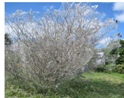
Uglynest Caterpillar, Brunswick, June 2013.

Uglynest Caterpillar ( Archips cerasivorana ) – Uglynest caterpillars are around every year webbing up small cherry saplings along roadsides and hedgerows. But occasionally they go wild. This year there have been multiple reports of ‘Uglynest Gone Wild’; from Orono to South Berwick. The pale yellow larvae with paired black spots feed on cherry and other hardwood trees and shrubs. There is one generation a year but they can be around from May until September. Once they eat all the leaves off a tree they make webs across lawns, fields and objects in their way as they move to other trees. This may be a one-year phenomenon.