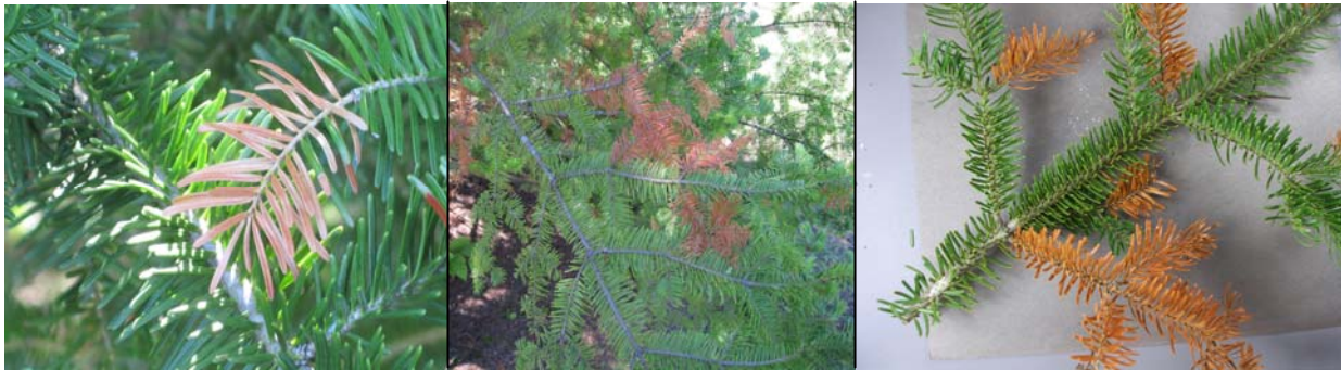
Branch dieback of balsam fir, Acton.

Balsam Fir Branch Flagging – Numerous calls have been received this month regarding branch “flagging” in balsam fir. Trees of any age may show the symptoms of needles that are discolored to a tan or reddish appearance. Samples have been observed from Acton, Arrowsic, East Sebago, Livermore, Richmond, Whitefield, and Windham. No specific pathogen or insect has been identified; a few but not all of the twigs were injured (fed on) by pine sawyer beetle adults. This does not account for all the damage or the severity of damage on some individual trees. Several hypotheses for the cause of damage include fine root-tip injury due to the excessively warm late winter of last year to root and butt rot activity. It may be that the visible dieback is a non-specific symptom of tree stress that develops from any of a number of causes. So far a satisfying diagnosis has not been found, but the condition will continue to be examined and monitored.