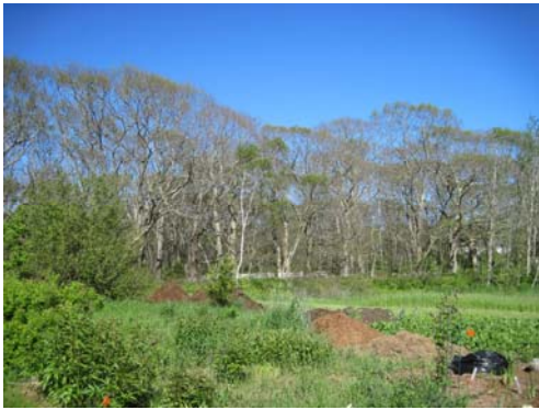
Winter Moth Defoliation. Harpswell, June 2013.

Winter Moth ( Operophtera brumata ) – Winter moth caterpillars have finished up feeding for the year. The oak and other hardwoods defoliation is dramatic in parts of Harpswell, Cape Elizabeth, Vinalhaven and Peaks Island. There is light damage in other coastal towns. The larvae have spun down to the ground to form cocoons in the soil where they will stay until December. Do not move plants including tree saplings - or soil from winter moth infested areas as you will be moving the winter moth cocoons in the soil. They are small and look like small clumps of soil.