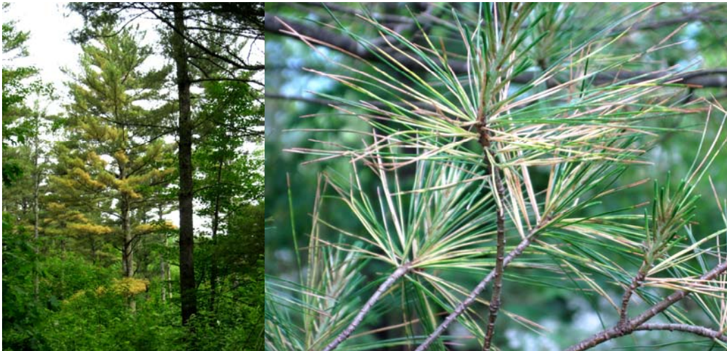
White pine needlecast, Bethel, June 2013.

Of concern now is the number of years the damage has occurred. First reports of widespread occurrence of this damage began in 2007, with increasing severity noted yearly until 2010. During 2011 and 2012, the problem was judged to be somewhat less severe. This year then marks the seventh consecutive year of partial defoliation of many white pines. Many affected trees have recently shed lower branches, a symptom of increased stress levels. In some situations, mortality has occurred where affected trees were growing on adverse sites, or were otherwise previously compromised by other damaging agents. If high levels of infection and needle loss continue in future years, the potential exists for greater losses to mortality.