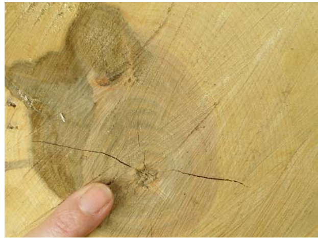
Ray shakes common to many freshly-cut trees in a young woodlot. The separation was not due to drying after cutting.

While the following explanation may be difficult to prove, a very likely cause of this defect development was the Ice Storm of 1998. The area was well within the high-impact zone for the storm. At that time, the trees would have been saplings around 12 to 15 years old. During the ice storm, many of these young trees would have been bent or “doubled over” for some time following the event. Flexing such as this can result in the development of severe stresses and “shake” in the wood. Shake is a separation of the wood cells, either along the radial axis (ray shakes), or of the annual rings along the longitudinal axis (ring shakes). Some top and branch breakage may also have occurred, and could easily account for the dark staining in the centers. Such defects are not especially common in forests growing under normal circumstances, but extreme events such as the ice storm can significantly alter the growth and development of the stems throughout the life of the affected trees