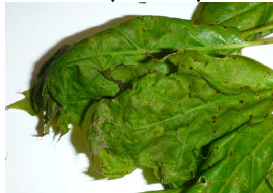
Oak leaf cupping and spotting displaying an early infection stage of oak anthracnose.

A second problem has been frost damage. The frosts occurred on May 13th and 14th, with another episode about a week later, in many places. In general, the frosts were “light,” (not a deep or extended freeze) and resulted in some marginal leaf damage, but did not freeze the entire leaf. Both problems have occurred right at the time of budbreak and leaf expansion for oaks – a critical time for leaf development, hence the “cupping” of leaves on many trees, and/or the premature defoliation on some.