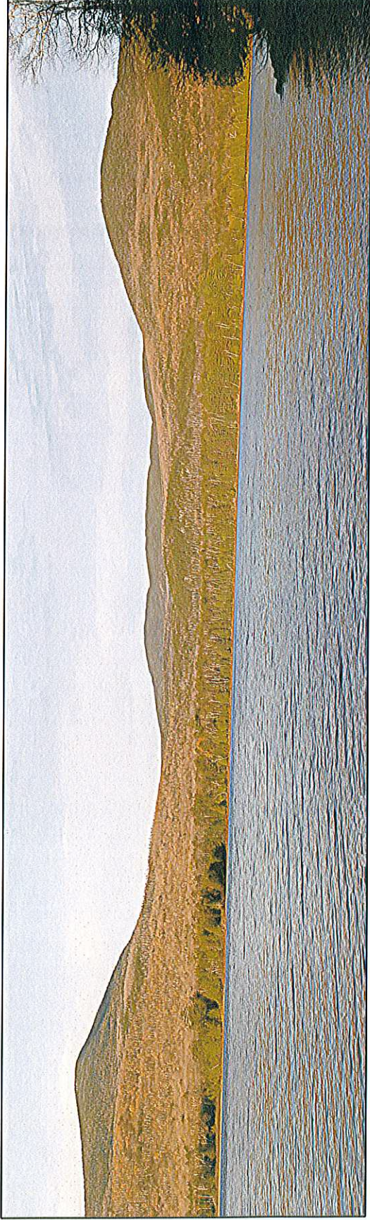
11. Pan view from the south end of Long Pond showing the prominence of Mount Pisgah (left) and the southern peak of Sisk (right)