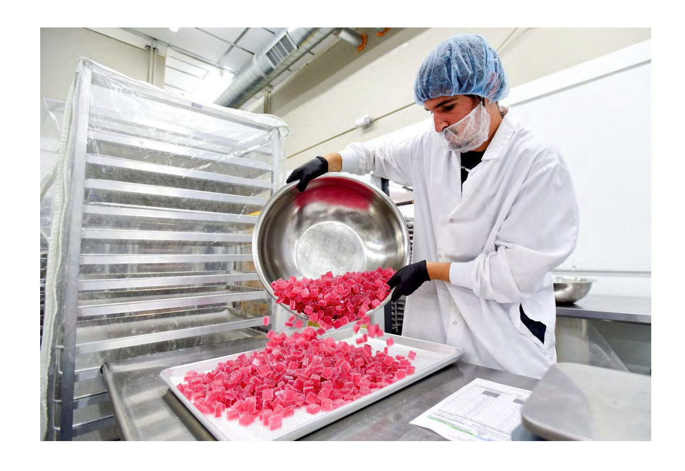
Marijuana Edibles Commercial Kitchen