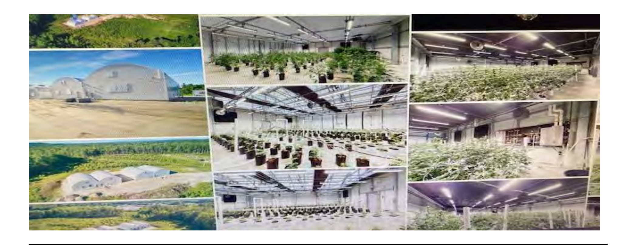
Greenhouse Cultivation Facility