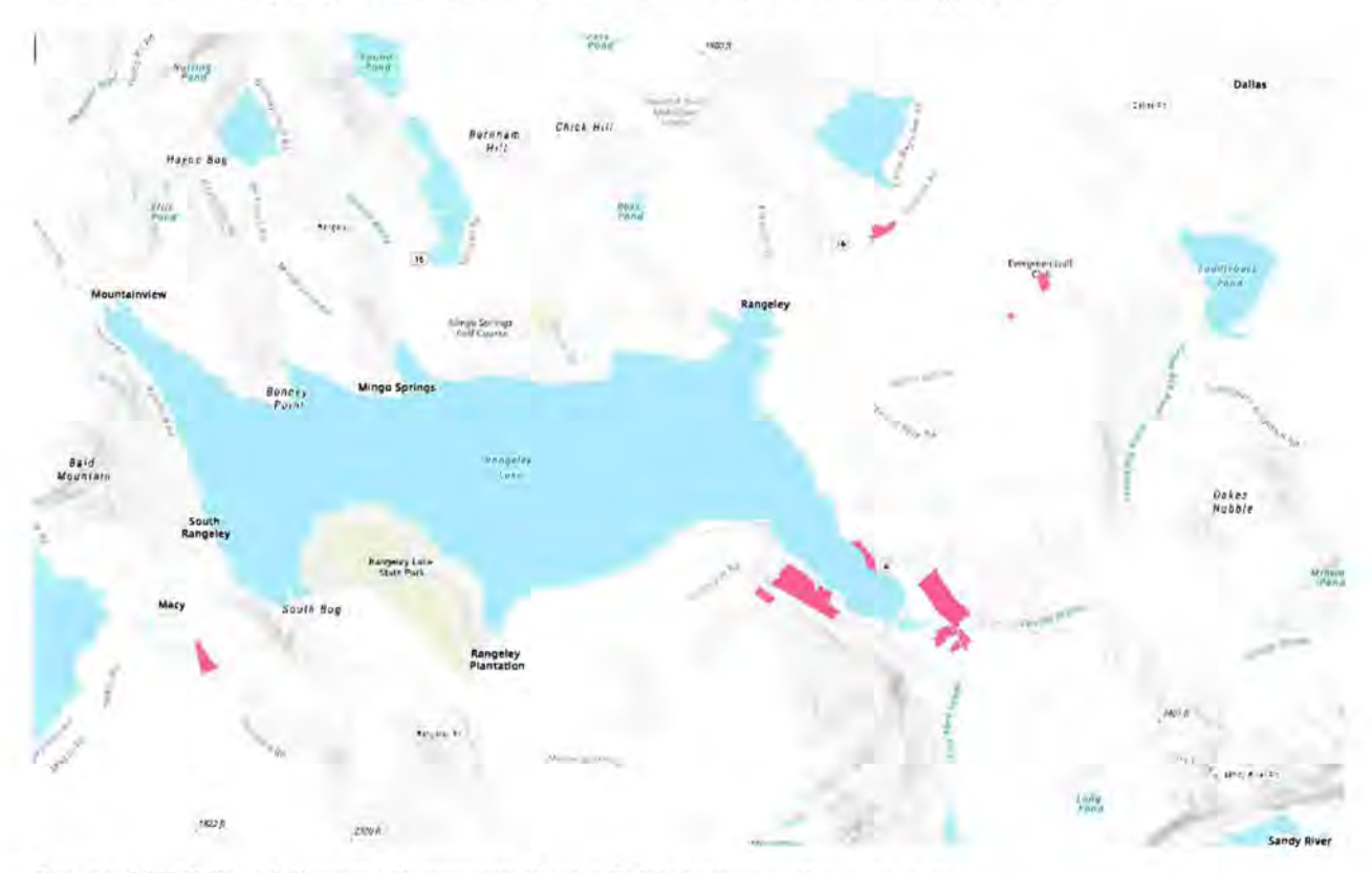
Community Center Subdistricts are shown in pink.

These Community Center Subdistricts are shown in pink on the map, below.