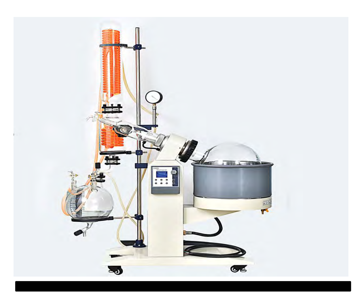
Rotary Evaporator (Roto Vape) – Used in Marijuana Distillate Production