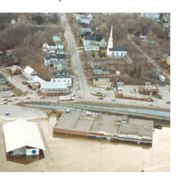
April 1, 1987

This interim rule adds a local area set-aside to the Federal Acquisition Regulation (FAR) for debris clearance, distribution of supplies, reconstruction, and other major disaster or emergency assistance activities. The contracting officer for the disaster defines the local set-aside area. The rule implements the Local Community Recovery Act of 2006, which strengthens the government's ability to promote local economic recovery. The local area set-aside does not replace small business set-asides. Both can be used at the same time. The rule imposes subcontracting restrictions when a local area set-aside is used. No competition justification is required for the local area set-aside.