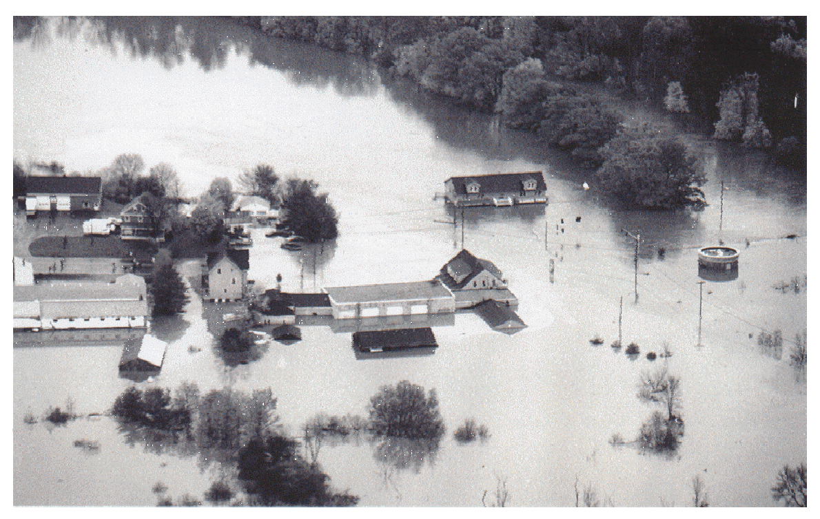
Aerial view of the Presumpscot River at the intersection of Route 302 in Westbrook, Maine on October 22, 1996.