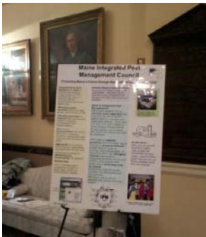
IPM Council poster displayed in the state capital's Hall of Flags