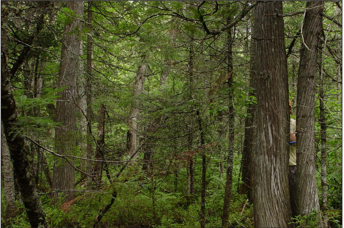
Northern White Cedar Swamp, Maine Natural Areas Program