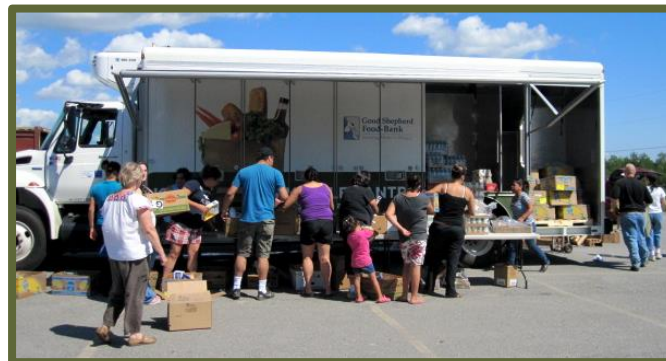
Referrals to Social Services