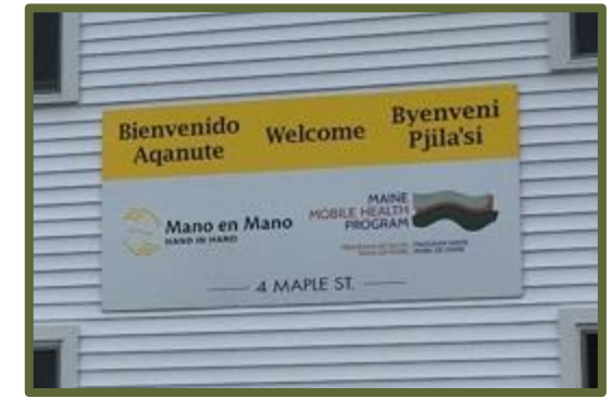
Health Center Operations