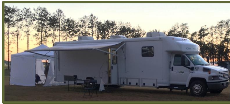
Mobile Health Services