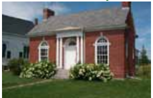
Gallison Memorial Library

Pass by blueberry barrens and the Pleasant River before the trail becomes semi-remote beyond Columbia Falls. The Wild Salmon Resource Center, Pleasant River Community Forest, Forest Hills Cemetery, Gallison Library, and Ruggles House & Garden are great side trips. A country store, 1 mile east of Columbia Falls is known for doughnuts and makes a good lunch and provisions stop.