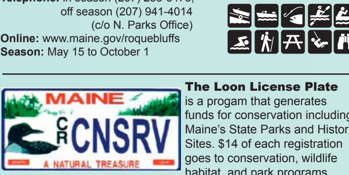
The Loon License Plate is a program that generates funds for conservation including Maine's State Parks and Historic Sites. $14 of each registration goes to conservation, wildlife habitat, and park programs.

Telephone: (207) 865-4465 Online: www.maine.gov/wolfesneckwoods Season: Open all year.