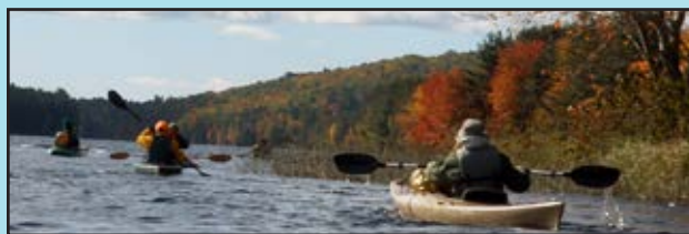
Kayaking along Androscoggin Riverlands State Park

Androscoggin Riverlands State Park lies just north of Lewiston-Auburn. Maine's second-largest urban area, in Turner. Its 2,800-acres offers 12 miles of river frontage, miles of multi-use trails and abundant opportunities for walking, fishing, boating, wild-life watching and hunting. Turner Boat Launch (a public boat launch owned and operated by NextEra Energy Resources, LLC) is located 1/3-mile south of the park's main entrance on Center Bridge Road. More than 1/2 of Maine people live within an hour's drive of this park. Location: Off Route 4 on Center Bridge Rd. in Turner. Lat 44.261181 / Lon -70.187399