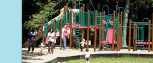
Playground at Bradbury Mountain State Park

Camden Hills State Park is 2 miles north of Camden on U.S. Route 1. Visitors can drive or hike to the summit of Mt. Battie for a panoramic view of Camden Harbor, Penobscot Bay, and inland lakes and rivers. The park offers 30 miles of hiking trails with access from three major trailheads. A 106-site camping area includes flush toilets, hot showers, and water and electric hook-ups on select sites. Salt and freshwater beaches are nearby. During the winter season, staff groom 6.5 miles of cross country and snowshoe trails, and the 1.5 miles of Mt. Battie Road for walking / exercise. Also available is a ski shelter with overnight accommodations which include a fireplace and bunkbeds. Please call ahead for availability. Location: 280 Belfast Road, Camden Lat 44.230138 / Lon -69.404736