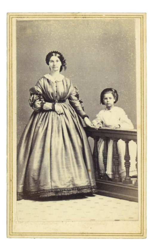
Figure 4-Unknown Misc. 13-Woman and Girl