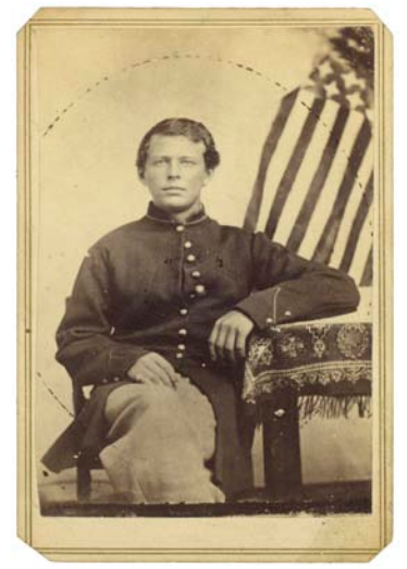
Figure 6-Unknown Enlisted Infantry (76) Courtesy-Maine State Archives

Figure 5-6th Maine Battery-Mounted Light Artillery-photo by S.W. Sawyer-Courtesy Maine State Archives