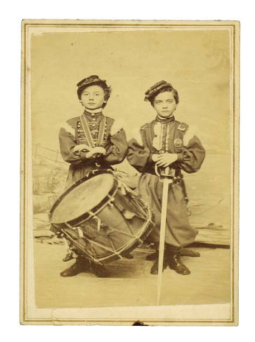
Figure 8-Unknown (Miscellaneous 6) drummer boys-Courtesy Maine State Archives