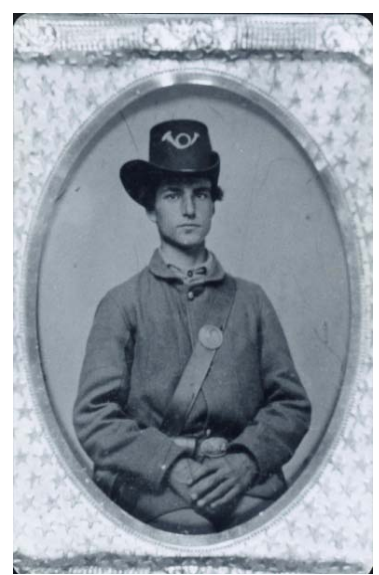
Figure 7-Unknown Enlisted Infantry (107)