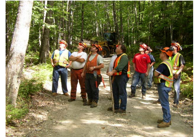
Tree Felling Preparation

The small class size makes this an excellent hands-on experience for everyone!!!