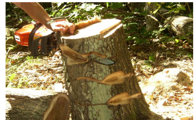
Chainsaw Basics Practice