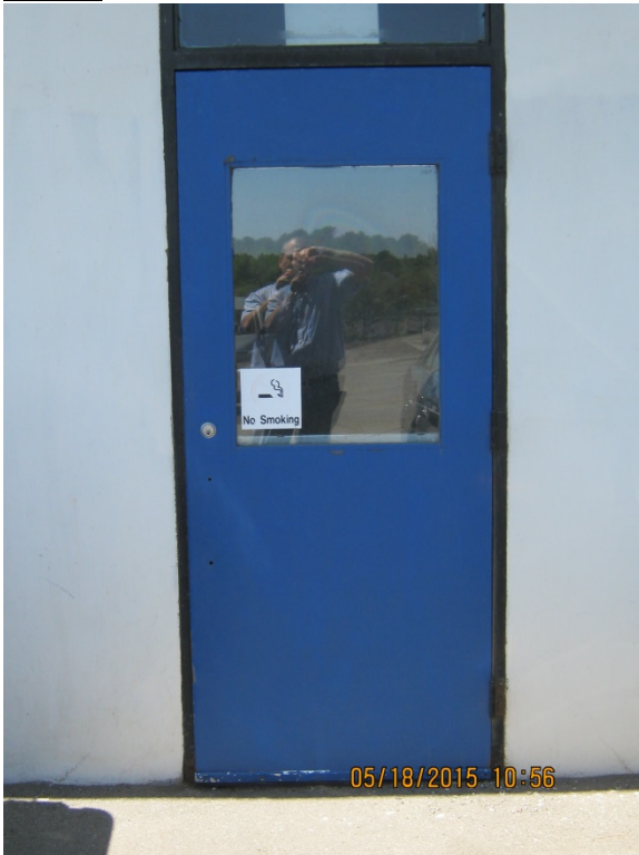
Single Entry Door and Single Window Dimensions: 36" x 83" Hollow Steel Door