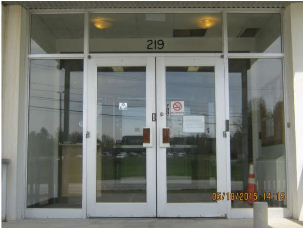
Double Entry Door Dimensions: To be field Verified Hollow Steel Door