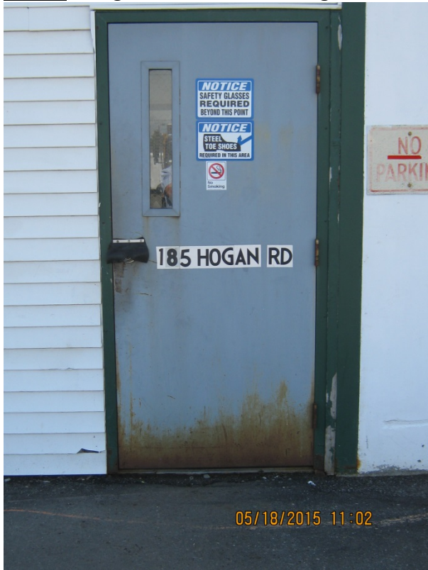
Single Entry Door and Window Dimensions: 36" x 80" Hollow Steel Door