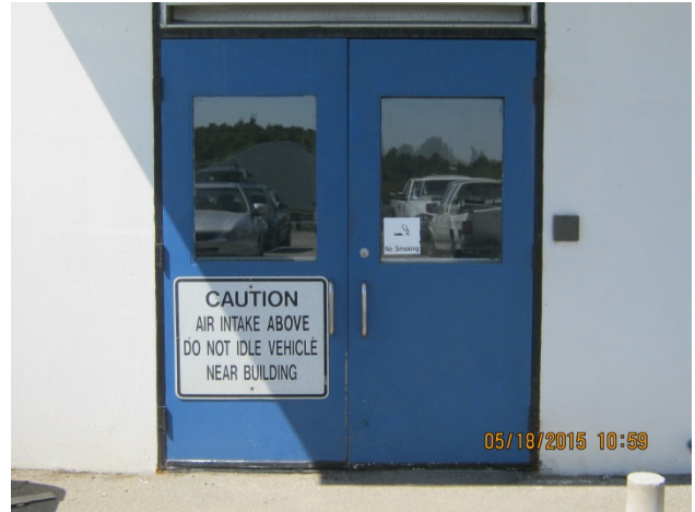
Double Entry Door with Louvers Dimensions: 36"x83" (per single door) Hollow Steel Door