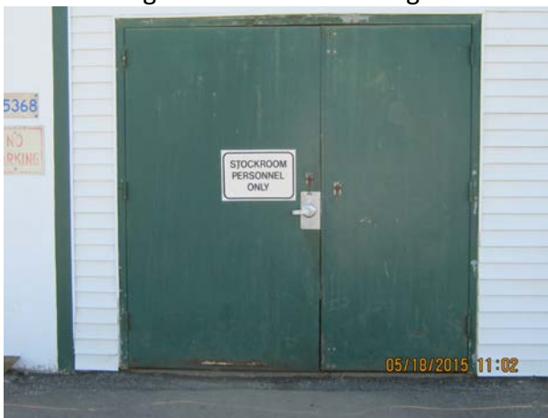
Double Entry Door with louvers Dimensions: 36" x 83" (small door) 48" x 83" (large door) Hollow Steel Door(s)