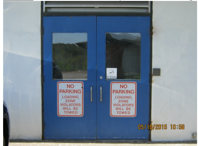
Double Entry Door with louvers Dimensions: 36"x83" (per single door) Hollow Steel Door