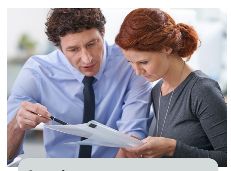
Bureau Contacts www.maine.gov/labor/unemployment

Watch our short informational videos for employers.