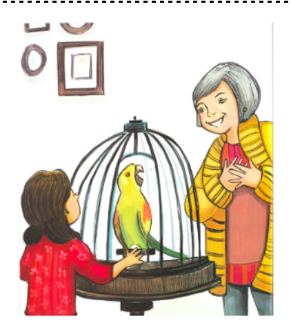
when we bring him home

phrases of time : adverbs that describe when