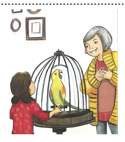
when we bring him home