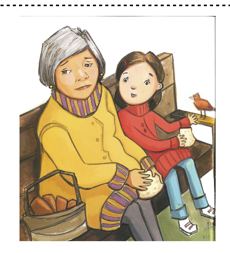
the rest of the winter