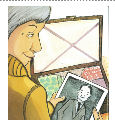
just before we turn out the light