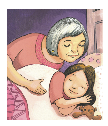
until my eyes grow heavy