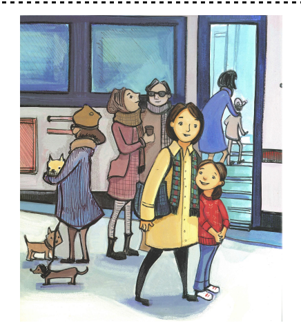
the next day