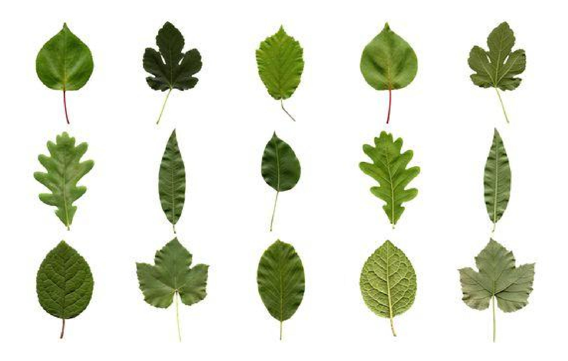
Science and Engineering Studio U3 W3

Focus on First/ 1st Grade for ME | Boston Public Schools Department of Early Childhood P-2/ Maine Department of Education