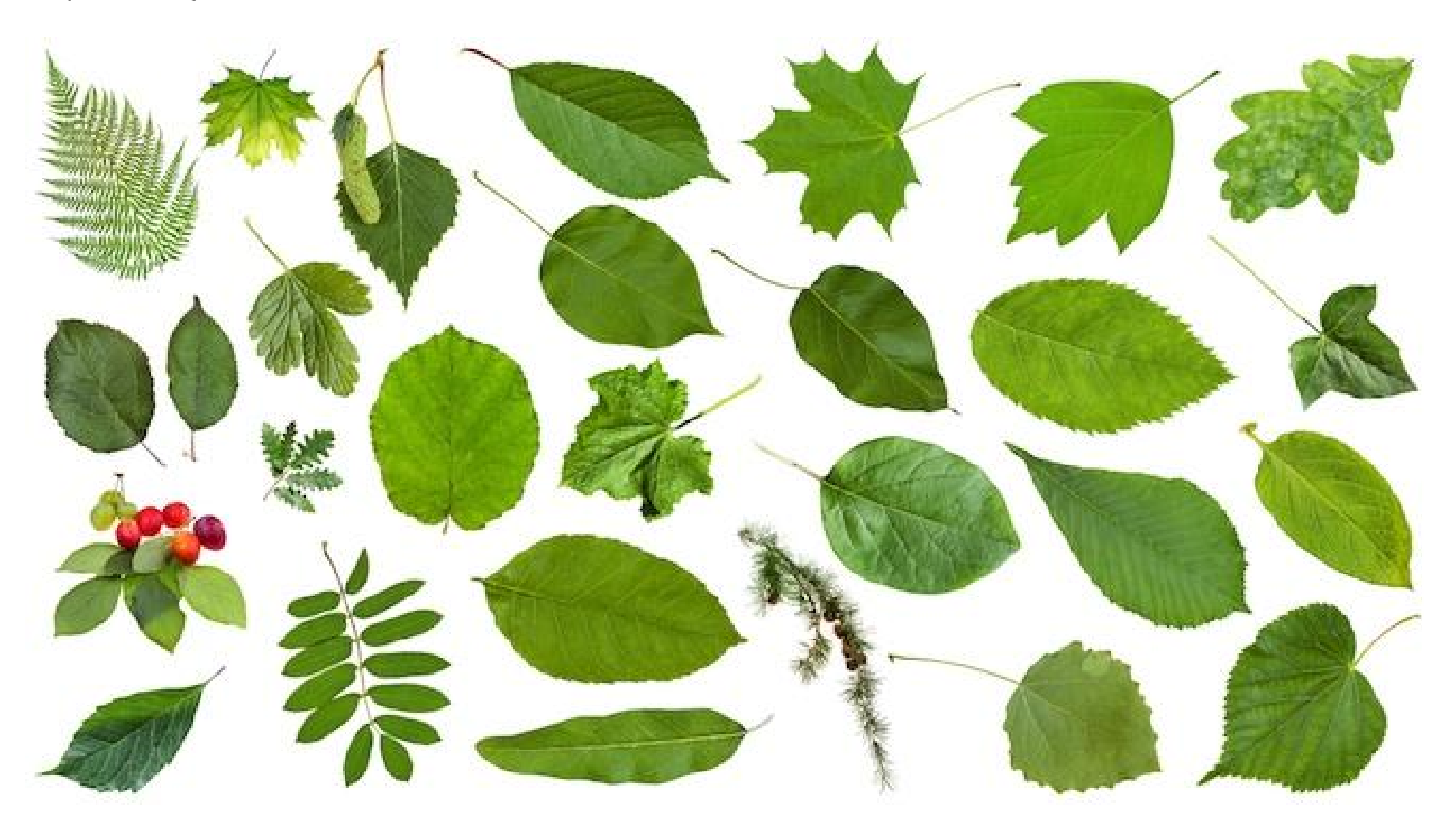
Leaf images Cut apart for sorting.