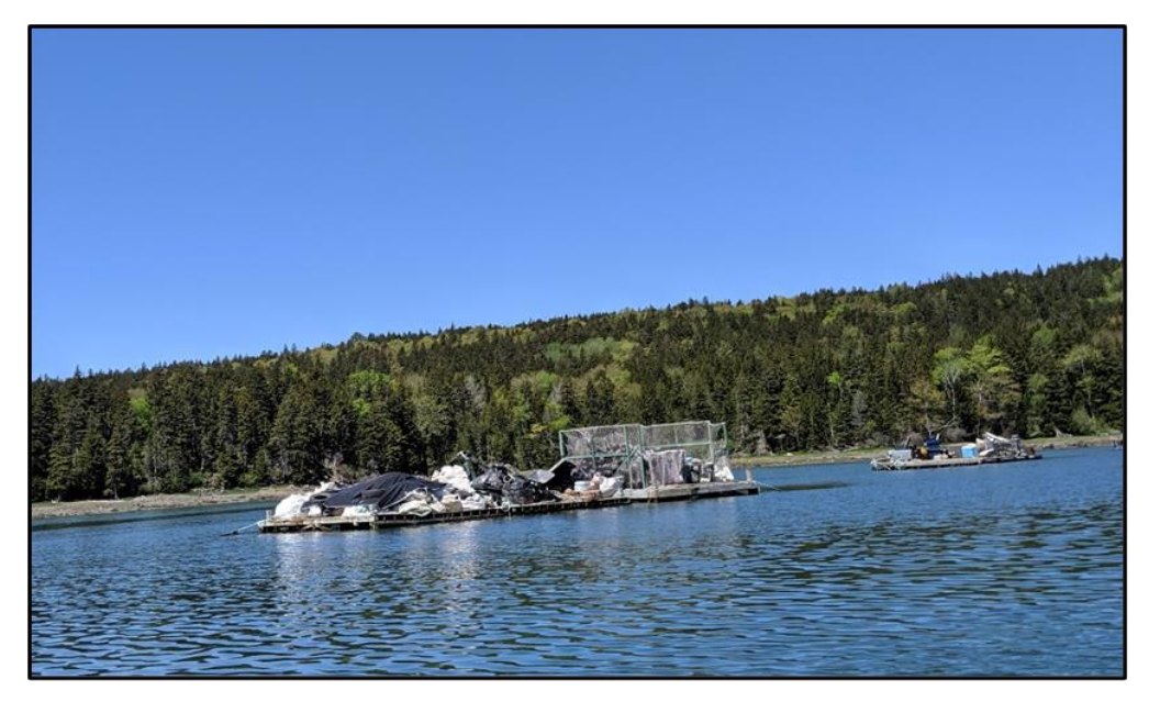
Image 2 : Storage floats with buoys, rope, mussel tumbling equipment and possibly trash. Image taken by DMR staff on June 7, 2019. Image 10 from the Site Report.

During the 2019 site visit, DMR took photographs of the floats and other structures within Great Cove. The floats contained buoys, rope, mussel tumbling equipment, and what appeared to be trash (SR 11). In addition, a polar circle that appeared to be broken was moored within the cove. Bartletts Island, LLC also submitted photographs of equipment and storage floats from April and October 2019 (Exhibits 9-11). These images depict rope, totes, and what also appears to be unsecured trash. Based on documentation from 2019, the storage floats and other equipment in Great Cove were in poor condition. The photograph below, from DMR's site report, depicts the condition of one of the storage floats from 2019.