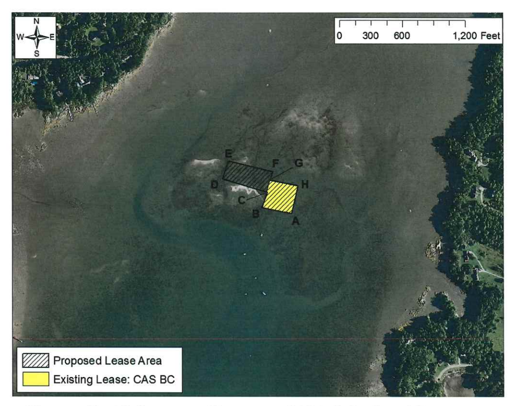
Figure 1: Depicts the proposed lease area, which includes the existing experimental lease CAS BC.

Cumberland. At mean low water, the distance from the northwestern corner of the proposed lease site (corner E) to the western, or Cumberland shore of Broad Cove is ~1,030 feet (SR 5). The distance, at mean low water, from the southeastern corner of the proposed site (corner A) to the eastern, or Yarmouth shore of Broad Cove is ~ 1,315 feet.<sup>4</sup> Except for a deeper channel in the center of Broad Cove, wide areas of intertidal mud flats lie between the site and uplands. During low tide, over 70 acres of mudflats are exposed in the head of the Cove (SR 2). Water depths, at mean low water, range from 1.3 feet at corner C of the proposed site to 2.5 feet at corner B of the proposed site (SR 4).