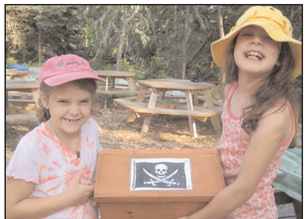
Finding the treasure chest.