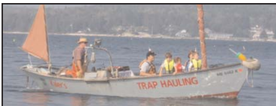
Lobstering aboard the Hunky Dory .