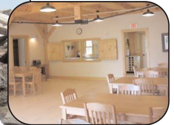
Single & triple berths