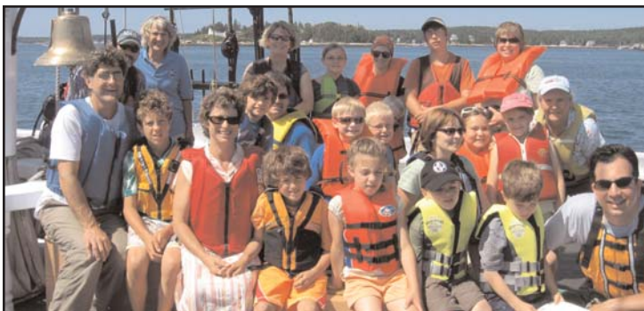
Aboard the Sherman Zwicker - a fishing schooner.