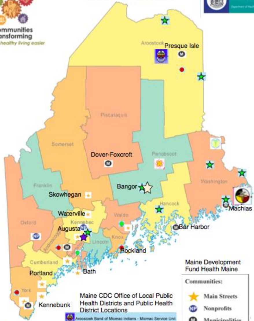
Maine CDC Office of Local Public Health Districts and Public Health District Locations