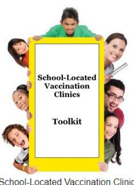
School-Located Vaccination Clinics Toolkit

The Maine Department of Education and the Maine Center for Disease Control and Prevention (Maine CDC) support Maine schools and community health partners efforts to provide school located vaccines if they choose to do so.