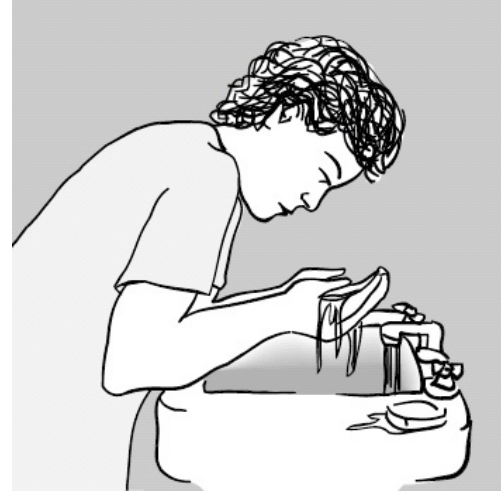
Wash your face and hands with soap and warm water before leaving work.

The Department of Health and Human Services (DHHS) does not discriminate on the basis of disability, race, color, creed, gender, age, sexual orientation, or national origin, in admission to, access to or operation of its programs, services, activities or its hiring or employment practices. his notice is provided as required by Title II of the Americans with Disabilities Act of 1990 and i accordance with the Civil Rights Acts of 1964 as amended, Section 504 of the Rehabilitation Act of 1973 as amended, the Age Discrimination Act of 1975, Title IX of the Education Amendments f 1972 and the Maine Human Rights Act. Questions, concerns, complaints, or requests for ditional information regarding civil rights may be forwarded to the DHHS' ADA Compliance EEO Coordinator, State House Station #11, Augusta, Maine 04333, 207-287-4289 (V) or 207-287 3488 (V), TTY: 800-606-0215. Individuals who need auxiliary aids for effective communication ir programs and services of DHHS are invited to make their needs and preferences known to the ADA Compliance/EEO Coordinator. This notice is available in alternate formats, upon request