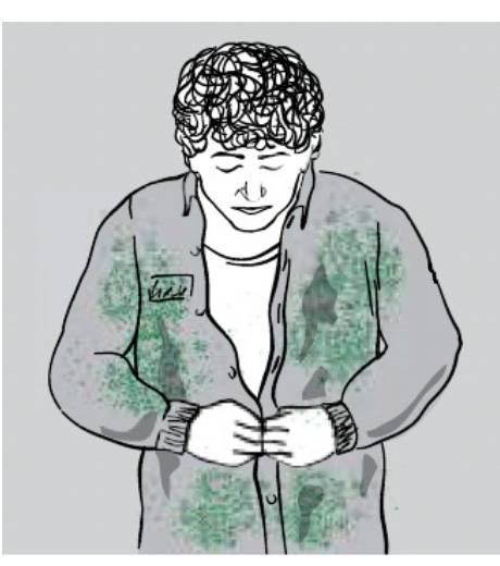
Change into clean clothes and shoes at work before you get into your car or go home. Put dirty work clothes and shoes in a plastic bag.