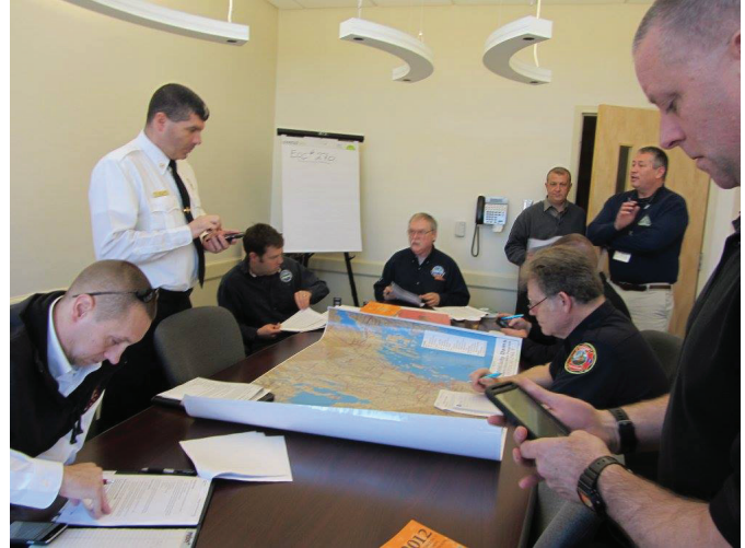
First responders strategize during the Androscoggin River Chemical Spill Tabletop on February 2, 2016 in Topsham.