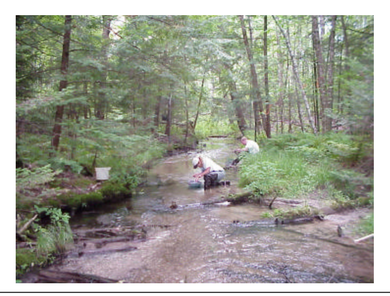
Hatchery Bk. downstream of MDIFW Dry Mills Fish Hatchery, August, 1999

Fish hatcheries are found on several spring-fed streams draining to the Pleasant River, north of Gray, Maine (Sta. 142 and 220). Fish hatcheries were formerly considered quite benign and, though licensed, were not held to strict discharge limits for solids and biochemical oxygen demand. Biological monitoring of benthic communities downstream of fish hatcheries has revealed detrimental impacts, however, due to enrichment effects of high nutrients and suspended organic solids. These inputs typically cause a significant increase in the abundance of organisms, with a predominance of filter-feeding caddisflies and black fly larvae. While this effect may be considered beneficial in terms of the ability of the down-stream reaches to produce fish, it should be borne in mind that the aquatic life indigenous to Maine's naturally nutrient-poor streams are not adapted to such enriched conditions. The alteration tips the balance in favor of opportunistic, generalist taxa that may out-compete and displace indigenous, rare and specialized organisms. The Department is in the process of relicensing all the hatcheries in the State and will be imposing stricter limits for biochemical oxygen demand, total suspended solids and, in some cases, for phosphorus.