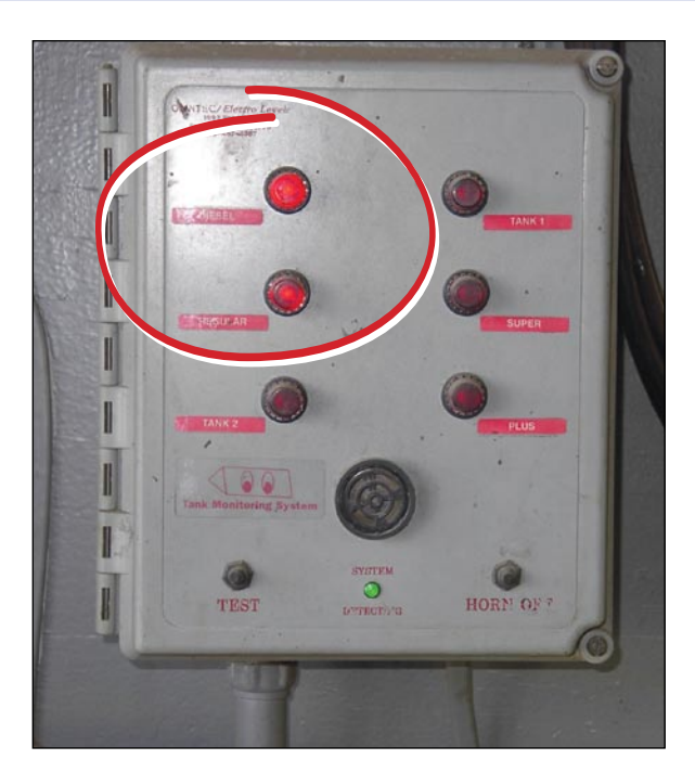
A tank interstitial leak sensor in alarm.