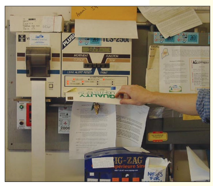
Do not cover up or ignore alarms. In this photo, a piece of paper was taped over the alarm lights so they could not be seen. This is NOT the proper response to an alarm!