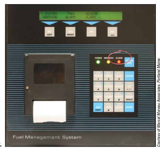
An ATG tank monitor in alarm.

alarm or blinking red or yellow lights! If you do not know what to do, call your service technician or the DEP (207-287-2651).