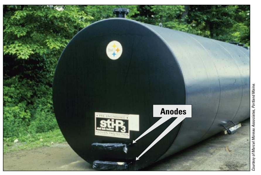
Zinc anodes attached to steel tanks are often used to provide protection against corrosion. The anodes in this picture are covered with plastic to protect them during manufacturing and shipping. The plastic will be removed when the tank is installed.

Galvanic CP uses simple chemistry, much like a flashlight battery, to produce the flow of electrons. The anode is typically a piece of zinc or magnesium that is buried in the ground and connected to the tank or pipe using a copper wire as the electrical pathway. If you own a boat, you are probably familiar with galvanic CP because zinc anodes are often used to protect outboard motors, propellers, and other underwater metal components of boats. Most of the CP systems in Maine are galvanic systems.