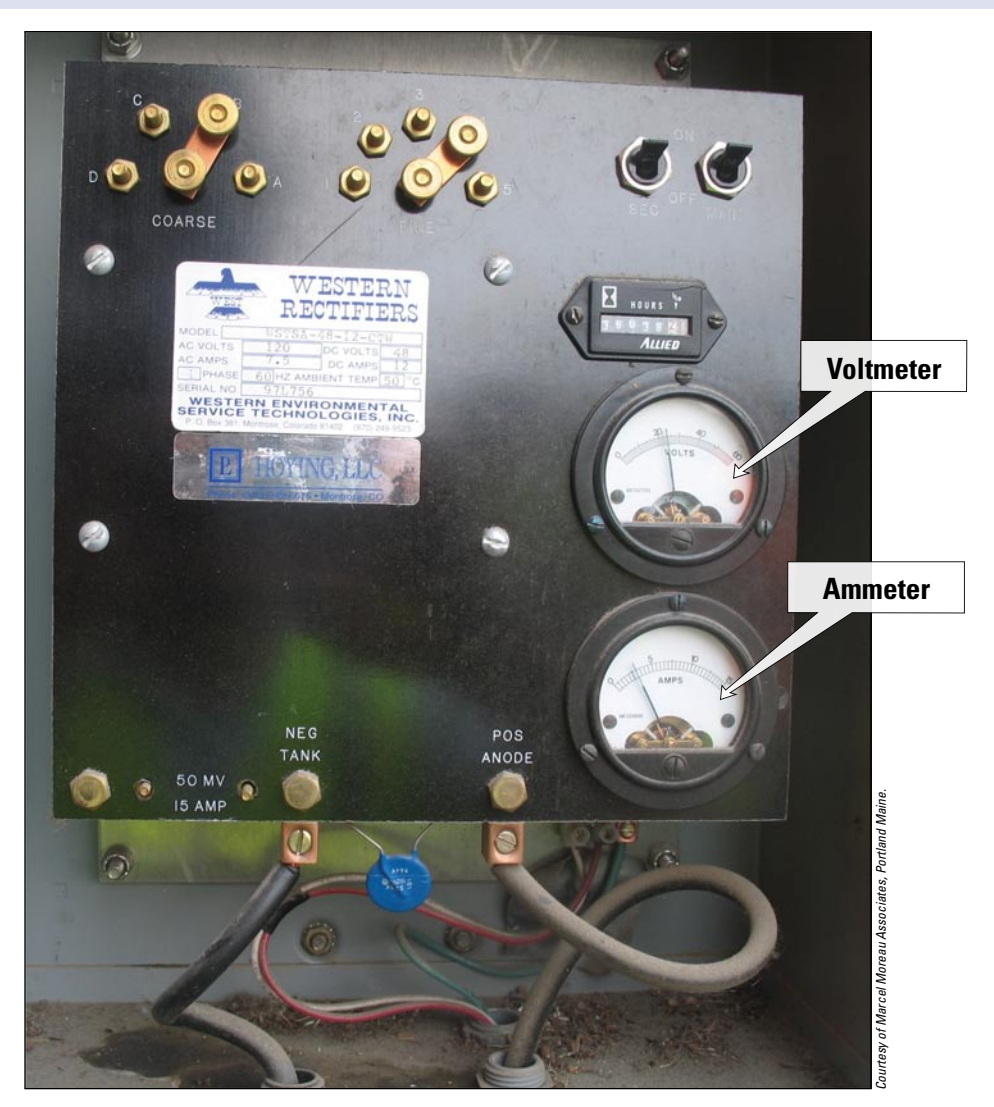
Most rectifiers are equipped with voltmeters and ammeters that provide a simple means of determining whether the rectifier and the CP system are operating properly. Keeping a monthly log of the meter readings is an important responsibility for UST operators who have impressed current systems.