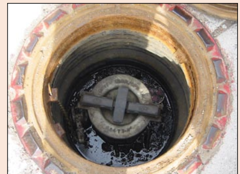
This spill bucket needs cleaning. Keeping spill buckets clean is a constant chore.