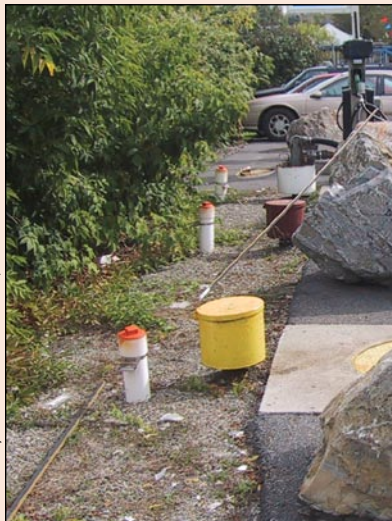
Above-grade spill buckets.