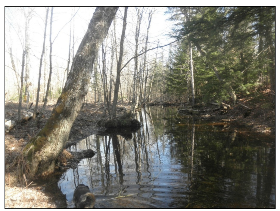
Photo 9: Typical backwater associated with the Piscataquis River. Stantec Consulting April 29, 2013.