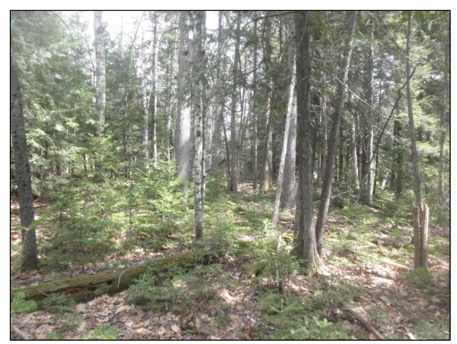
Photo 3: Deer Wintering Area with conforming cover. Stantec Consulting April 29, 2013.