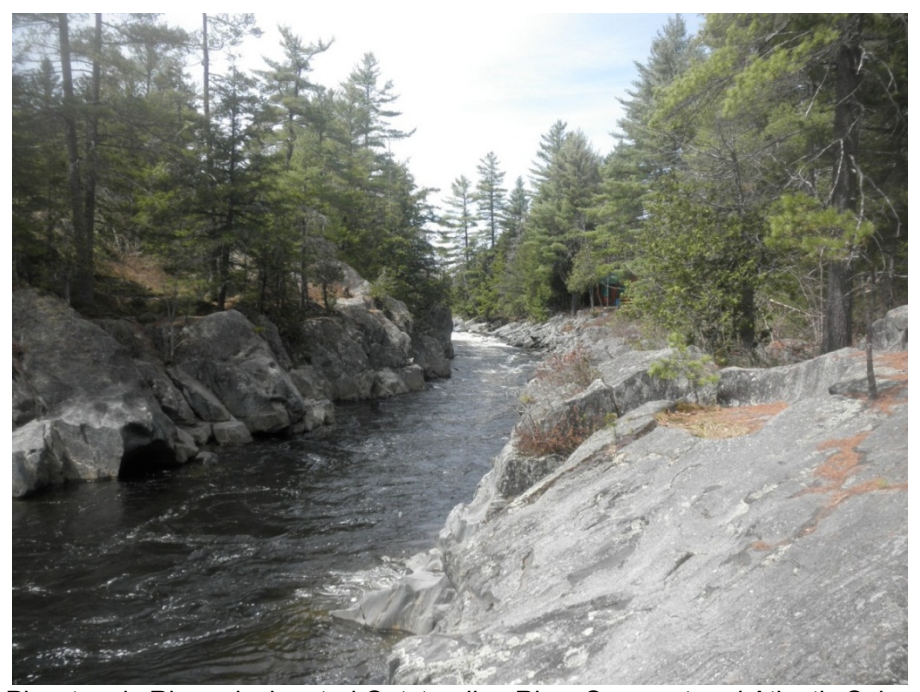
Photo 4: Piscataquis River, designated Outstanding River Segment and Atlantic Salmon Habitat. Stantec Consulting April 29, 2013.