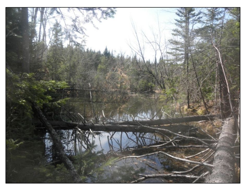
Photo 5: SVP151TT – natural significant vernal pool. Stantec Consulting April 29, 2013.