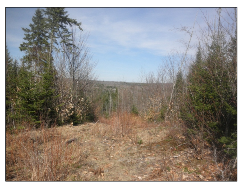
Photo 7: Typical previously harvested upland. Stantec Consulting April 29, 2013.