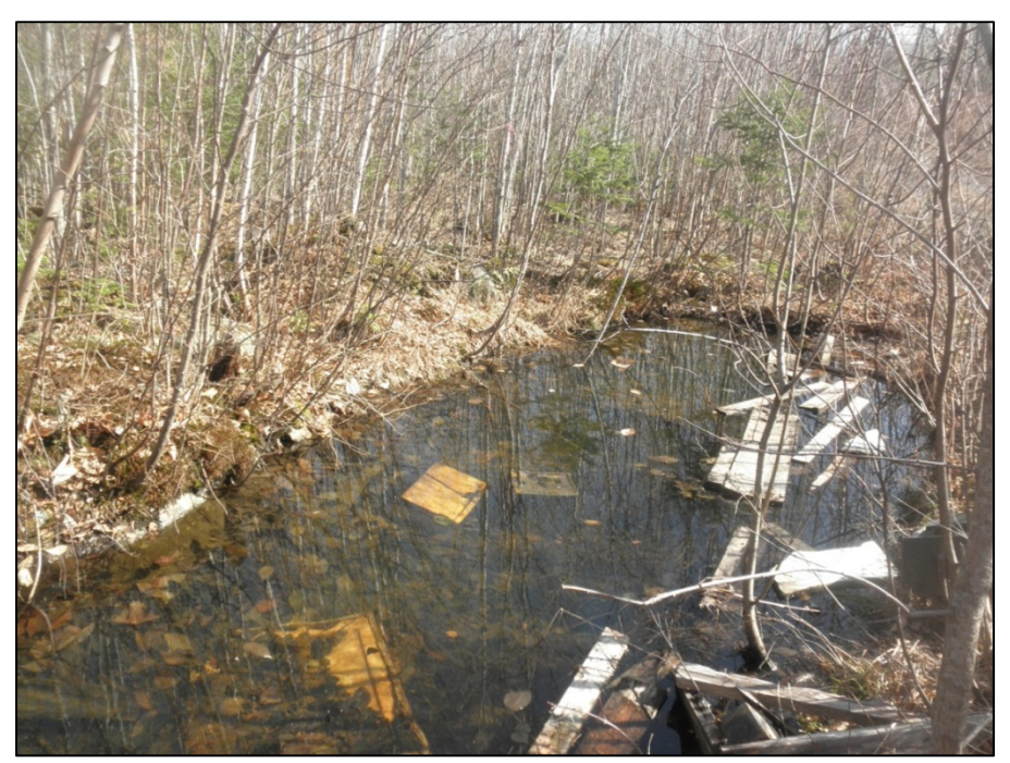
Photo 11: Borrow pit enhancement opportunity. Stantec Consulting April 29, 2013.