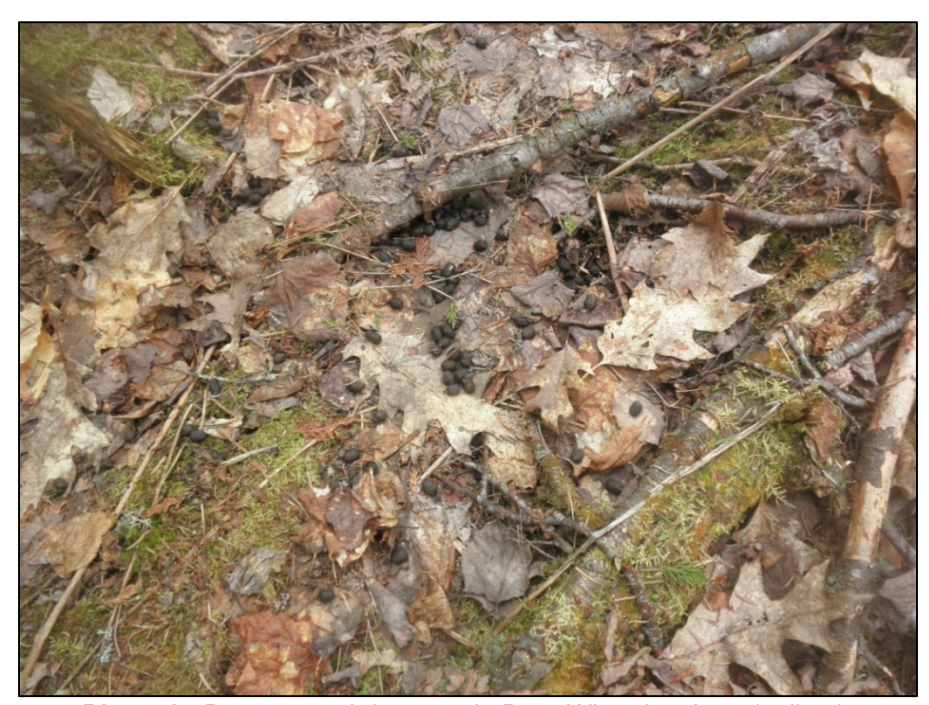
Photo 1: Documented deer use in Deer Wintering Area (pellets). Stantec Consulting April 29, 2013.