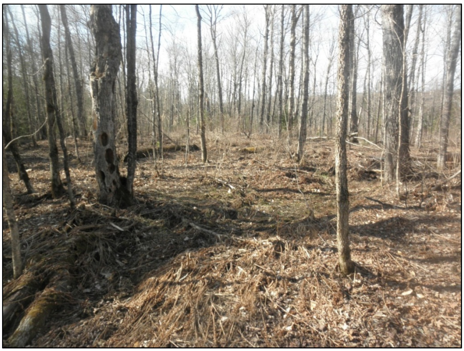
Photo 8: Typical forested wetland floodplain. Stantec Consulting April 29, 2013.