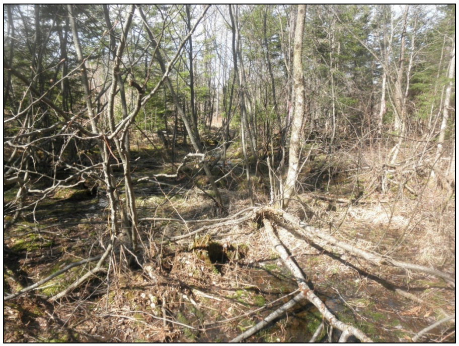
Photo 6: Typical scrub-shrub wetland. Stantec Consulting April 29, 2013.