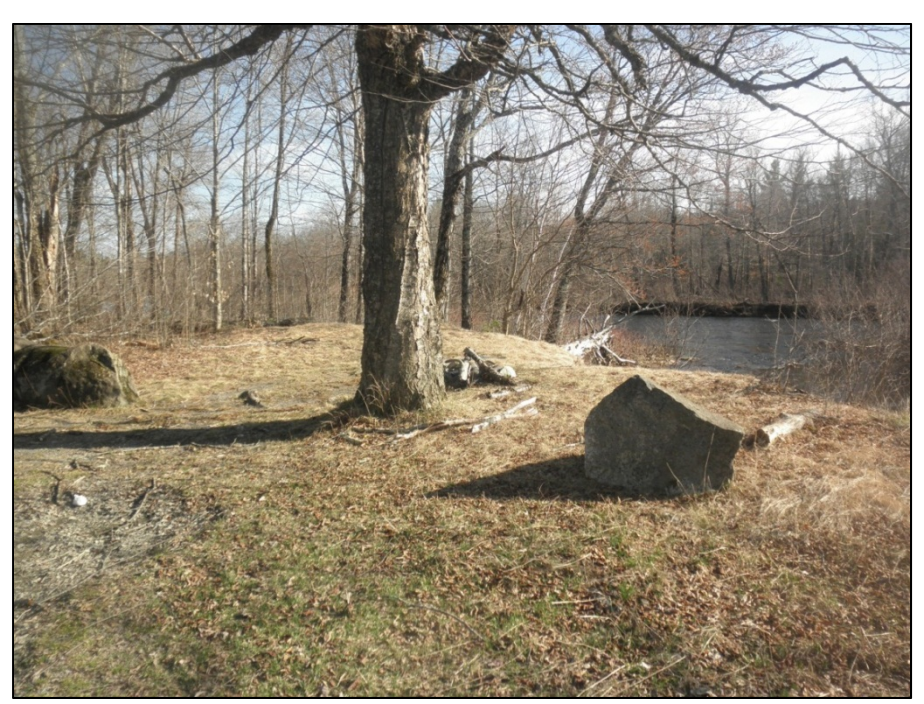
Photo 10: Scenic picnic area on Barrow's Falls Road. Stantec Consulting April 29, 2013.