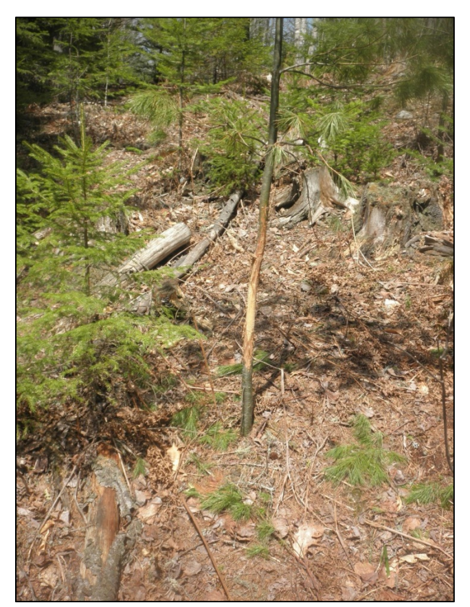
Photo 2: Documented deer use in Deer Wintering Area (tree rub). Stantec Consulting April 29, 2013.