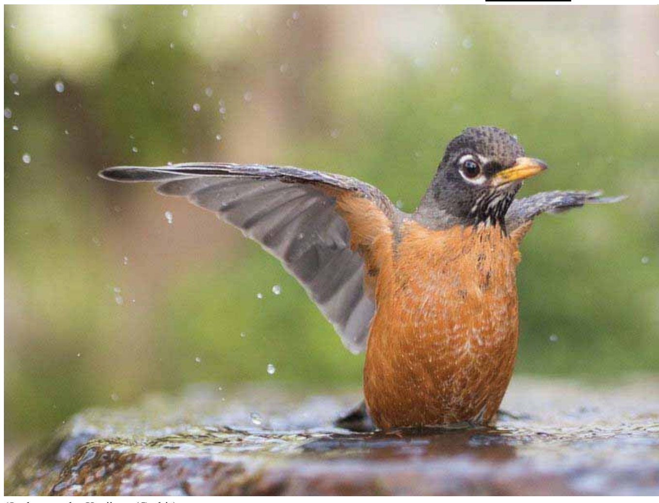
(Jouko van der Kruijssen/Corbis)