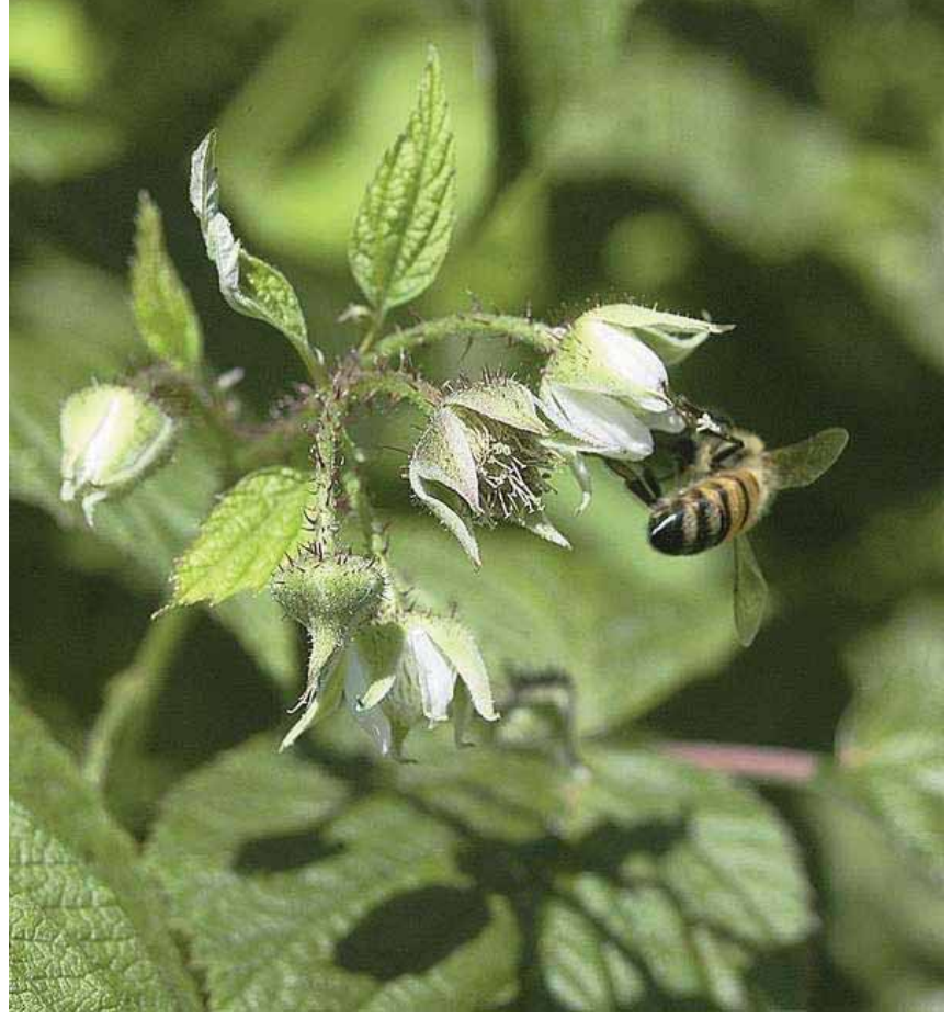
An investigation by the Oregon Department of Agriculture showed pesticides played no part in the deaths of thousands of bees in Clackamas County.

The latest Oregon bee deaths were a case of "classic starvation," not pesticides.