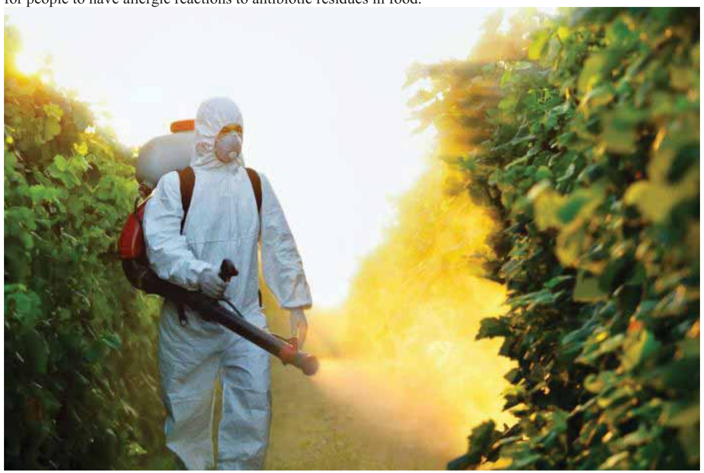
The use of antibiotics in agriculture is banned in some European countries, but it is still allowed in the US and Canada.

An article published in the Annals of Allergy, Asthma and Immunology finds that it is possible for people to have allergic reactions to antibiotic residues in food.