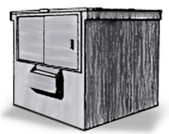
Disposal contracts should require that vendors regularly clean dumpsters.

Disposal contracts should clearly stipulate the type of container to be provided and that it is appropriate for the intended purpose. For instance, containers used for food waste should be sealed and sized appropriately for the amount of waste generated. Dumpsters should be placed as far away from the school building as practical.