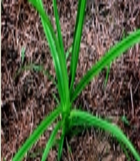
Perennial. Yellow nutsedge has triangular stems and leaves. Reproduces by underground tubers that can remain viable for years.