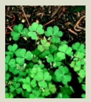
Annual. Creeping woodsorrel or oxalis has shamrock-like foliage. Produces small capsules that can eject seeds a long distance when it matures.