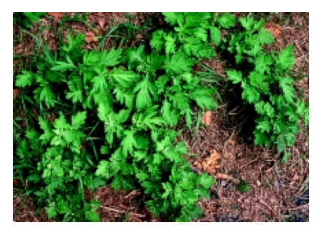
Mugwort—a perennial with foliage that resembles a chrysanthemum. Rhizomes can spread by tillage and topsoil disturbance. A major problem in nurseries.

If you're preparing an established bed for planting, decide if more than 30 percent of the garden is covered with weeds. If so, your best bet might be to remove perennials and prepare the bed like a new one. If weeds are scattered, dig out the toughest root systems by loosening and removing the entire root. Pull by hand the medium-sized weeds that will cooperate. Then till.