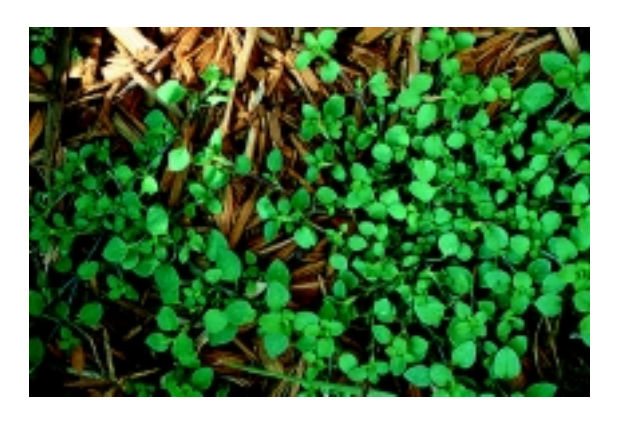
Chickweed—a winter annual that thrives in cool weather. It is often introduced to the landscape in container-grown ornamentals.

Two weeks before planting an established bed, loosen the top 3 inches of soil to be planted. A