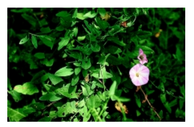
Field bindweed—a perennial with deep underground rhizomes; spreads by mowing or soil disturbance. Flower resembles a small morning glory. Can damage garden plants by twining around them.

Weed seeds drift in on breezes or are transferred by animals from nearby weedy areas. Keeping sites adjacent to your landscape fairly tidy will reduce the number of weed arrivals.