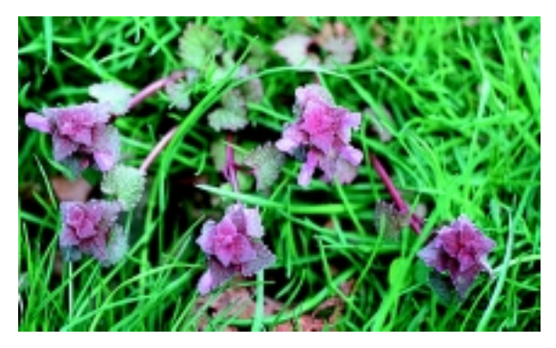
Purple deadnettle—a winter annual with distinct purple leaves and flowers. Germinates in the fall and flowers in early spring.

You can learn to recognize weeds that thrive under many conditions and compete with neighboring plants. Managing weeds in your garden or landscape does not have to be backbreaking and tedious. Start by removing as many weeds as possible, prevent new weeds from getting established in your garden, and, when weeds arrive, dig in!