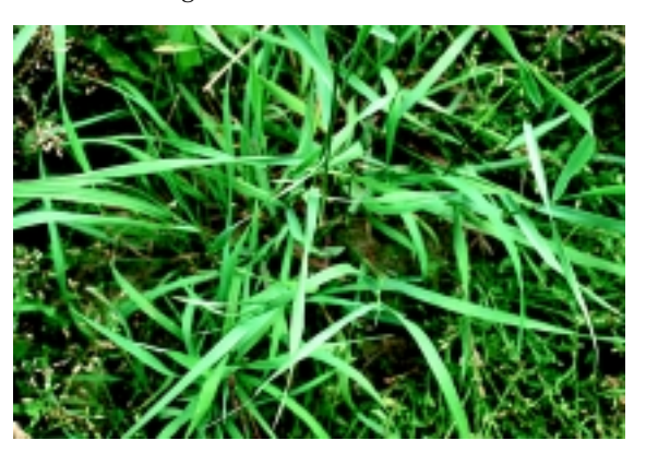
Quackgrass—a perennial grass that reproduces by seed or underground rhizomes. Can establish in dense mats and is often introduced to the garden by rototillers or soil movement.

When working around existing perennials or shrubs, the rules are the same: don't loosen any soil areas you aren't planting; keep the soil layers intact where possible; and, if the soil is worked, rake shallowly to disturb emerging weed seedlings.