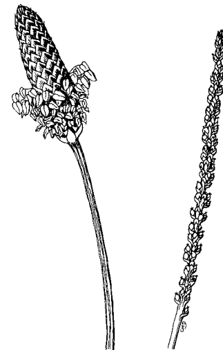
Figure 4. Flowering stalk of buckhorn plantain (left) and broadleaf plantain.