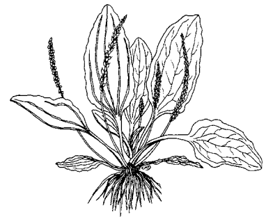
Figure 1. Broadleaf plantain.

Flowering begins soon after the seedling stage and continues throughout