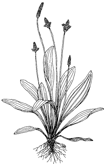
Figure 2. Buckhorn plantain.

Mulching with landscape fabrics can be effective for controlling seedlings of both species. Even established broadleaf plantain can be controlled if the fabric is overlapped and no light is allowed to penetrate to the soil. Use a polypropylene or polyester fabric or black polyethylene (plastic tarp) to block all plant