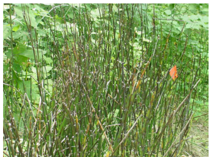
Figure 2. Horsetail growing in a colony in a ditch

Horsetail's impact as a weed might be considered marginal. With proper growing conditions and proper drainage, most crops can compete with this weed. However, aesthetics is