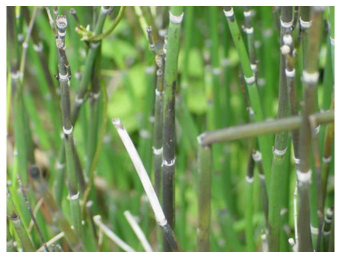
Figure 1. Close-up of the segmented stem and small grayish leaves.

One often finds horsetail in ditches and around ponds due to this sexual part of its life cycle. The gametophyte requires a wet environment to survive.