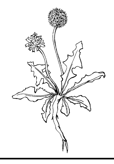
Figure 1. Dandelion.

Integrated Pest Management for Home Gardeners and Landscape Professionals