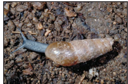
Figure 9. The decollate snail is a predator of snails.

Baits containing only metaldehyde are most reliable when temperatures are warm or during periods of lower humidity. When it is sunny or hot, these baits cause snails and slugs to die from desiccation or dehydration. The pests usually die with one day of ingesting the chemical or getting it on their foot. If cool, wet weather follows the baiting, they can recover if they ingest a sublethal dose. Don't water heavily for at least 3 or 4 days after bait placement, since watering will reduce effectiveness. Most metaldehyde baits break down rapidly when exposed to sunlight and high irrigation; however, some paste or bullet formulations (e.g. Deadline) hold up somewhat longer in these conditions.