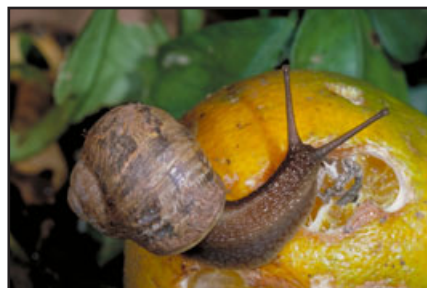
Figure 1. Brown garden snail.

A good snail and slug management program relies on a combination of methods. The first step is to eliminate, as much as possible, all places where they can hide during the day. Boards, stones, debris, weedy areas around tree trunks, leafy branches growing close to the ground, and dense ground covers such as ivy are