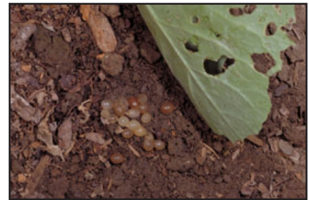
Figure 5. Snail eggs.

Some people use beer-baited traps buried at ground level to catch and drown slugs and snails that fall into them. Because it is the fermented part of the product that attracts these pests, you also can use a sugar-water and yeast mixture instead of beer. However, these traps aren't very effective for the labor involved. Beer traps attract slugs and snails within an area of only a few feet, and you must replenish the bait every few days to keep the level deep enough to drown the mollusks. Traps must have deep, vertical sides to keep the snails and slugs from crawling out and a top to reduce evaporation. You can purchase this type of snail and slug trap at garden supply stores.