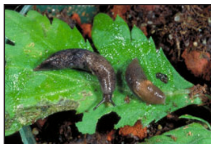
Figure 3. Gray garden slugs with chewing damage and slime trails on leaves.