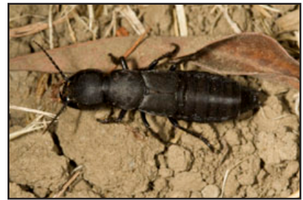
Figure 8. The devil's coach horse, Ocyopus olens , which is more than an inch long, is a predatory beetle that feeds on snails and slugs.

Some metaldehyde products are formulated with carbaryl, partly to increase the spectrum of pests controlled such as soil- and debris-dwelling insects, spiders, and sowbugs. However, carbaryl is toxic to earthworms and soil-inhabiting beneficial insects such as ground beetles, so it is better to avoid using snail baits containing carbaryl.