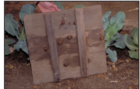
Figure 6. This turned over board trap reveals snails on its underside.