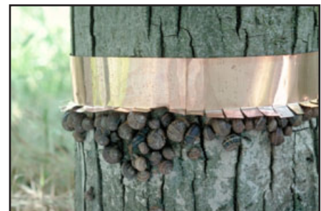
Figure 7. Copper barriers can keep snails and slugs out of trees and raised beds.