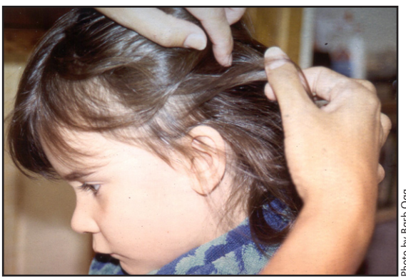
Figure 3. Look for signs of head lice by examining all areas of the scalp. Look for live lice and/or eggs.

lice. It is an electronic comb with metal-coated teeth that runs on one AA battery. When turned on, a soft, high pitched hum is emitted. When the metal teeth trap live lice, the humming stops. We have used this on children