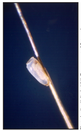
Figure 7. Head lice egg with a dead embryo.

A. The possibility for both of these parents is their children are being incorrectly diagnosed. Studies have shown that some health care workers sometimes misdiagnose head lice infestations, both by declaring lice were present when they weren't (false positive) and by not finding lice when they were there (a false negative). It is difficult for even well-trained individuals