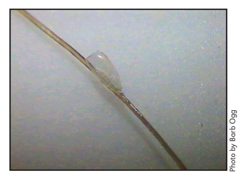
Figure 4. Nits stay attached to the hair shaft even after hatching (highly magnified view).

Studies have shown even trained professionals occasionally miss live lice because the immature lice are so small and hard to see. It is also easy to mistake dandruff or hair casts for nits. Using an electronic comb may be helpful in determining whether live lice are present.