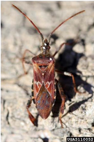
Western conifer seed bug (adult). Actual size: about 3/4 inch long.