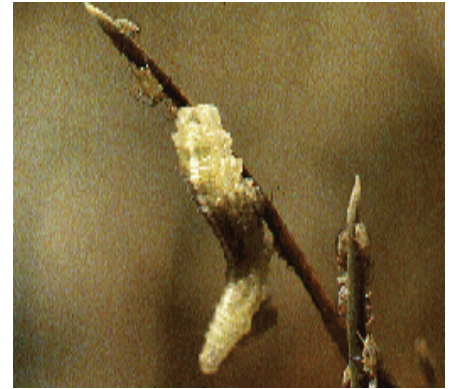
Figure 6: Syrphid fly larva.