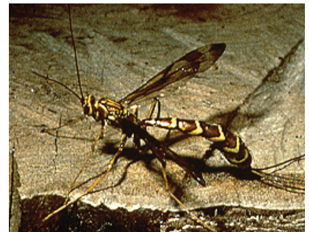
Figure 11: Ichneumon wasp.

These are a large and diverse group of insect parasites. Some are small and attack small insects such as aphids. Others live in the eggs of various pest insects. Larger parasite wasps attack caterpillars or wood-boring beetles.