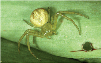
Figure 8: Crab spider.