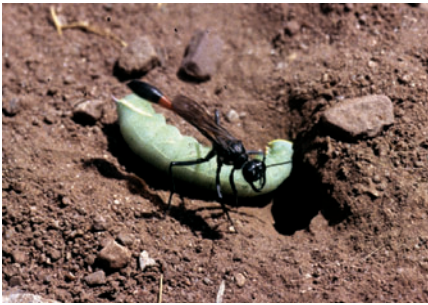
Figure 7: Hunting wasp ( Ammophila ) at prey with caterpillar.