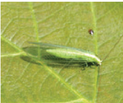
Figure 3: Green lacewing adult.