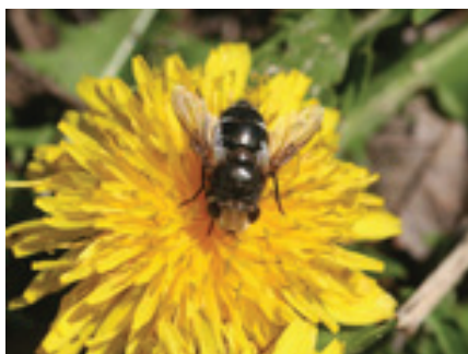
Figure 10: Tachnid fly feeding on nectar.