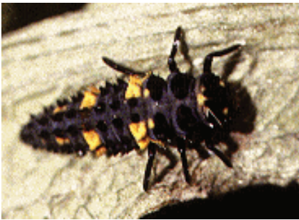
Figure 2: Typical lady beetle larva.