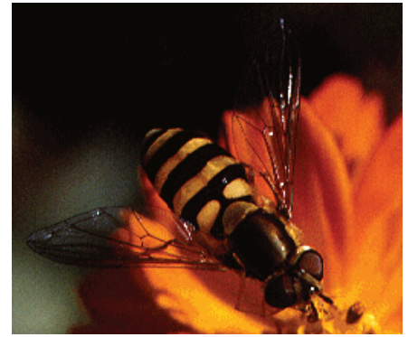
Figure 5: Syrphid fly adult.

It is the larval stage of the syrphid fly that preys on insects. Various colored, the tapered maggots crawl over foliage and can eat dozens of small, soft-bodied insects each day. Syrphid flies are particularly important in controlling aphid infestations early in the season, when cooler temperatures may inhibit other predators. Similar in appearance to syrphid fly larvae is a small, bright orange predatory midge ( Aphidoletes ). These insects often can be seen feeding within aphid colonies late in the season.