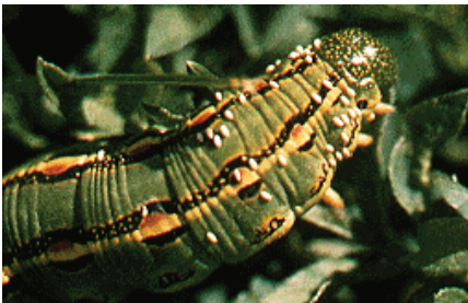
Figure 9: Tachinid fly eggs (white) laid near head of hornworm caterpillar.