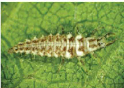
Figure 4: Green lacewing nymph.

predators capable of feeding on small caterpillars and beetles, as well as aphids and other insects. In general shape and size, lacewing larvae are superficially similar to lady beetle larvae. However, immature lacewings usually are light brown and have a large pair of hooked jaws sticking out from the front of the head (Figure 4).