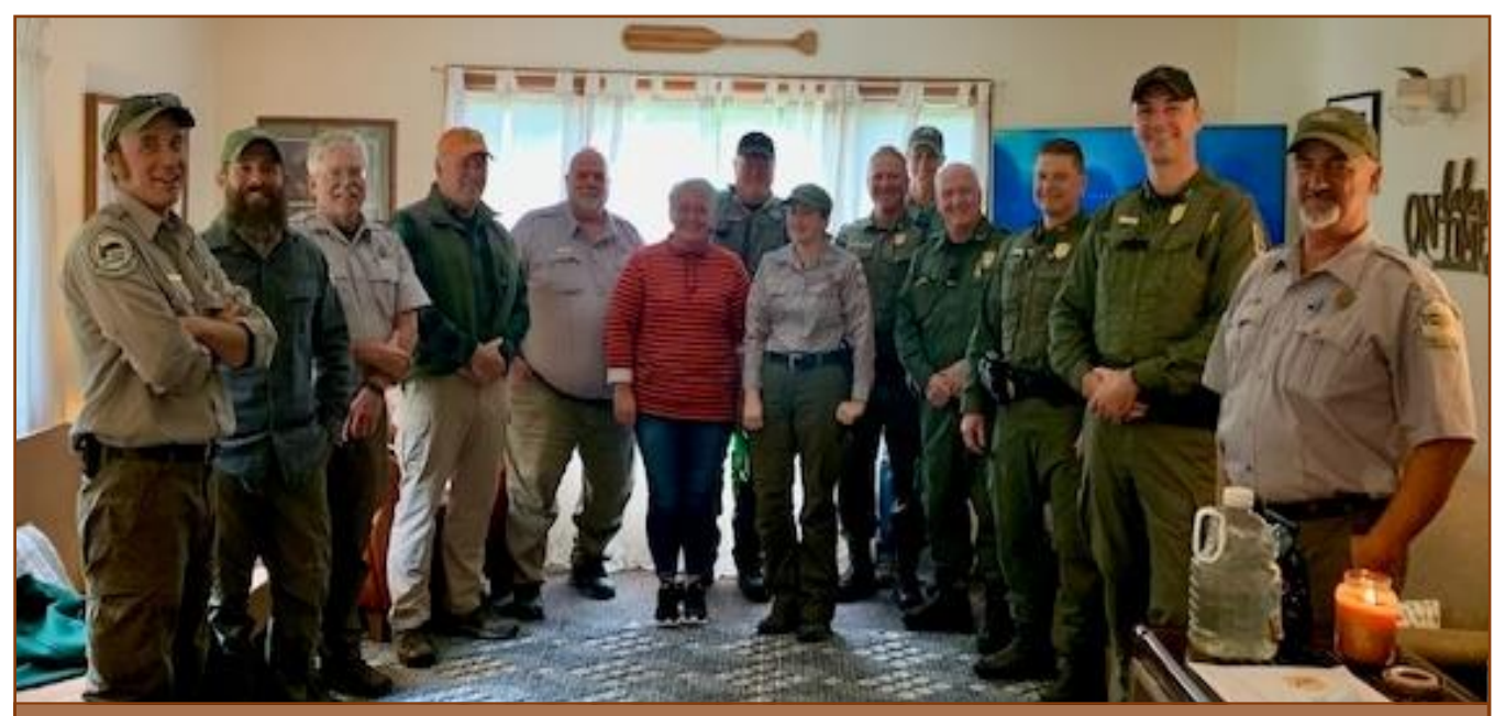
The AWW Team having an appreciation luncheon at Churchill Dam HQ with representatives from the Maine Forest Service, North Maine Woods, and IFW. We are fortunate to be surrounded by great partners – Thank you!