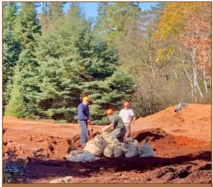
Rangers and volunteers filling burlap bags for leakage mitigation efforts at Telos Dam.