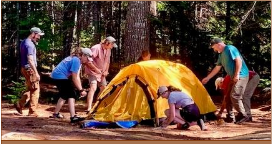
The AWW Rangers at Scofield Point setting up a tent as part of the camping safety training.

The AWW staff spend time every day informing and educating many Waterway visitors on a variety of topics, such as important safety tips, canoe/camping skills, rules and regulations, the history and culture of the AWW, recreational and sightseeing opportunities, and information about AWW flora and fauna.