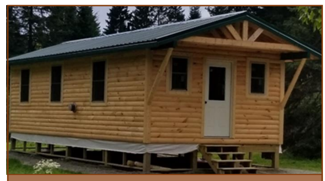
New Farm Brook Cabin at Michaud Farm