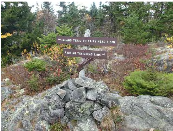
Trail Signs on the Cutler Unit

Cutler Coast. The Maine Conservation Corps, funded through the Recreational Trails Program, continued work rehabilitating trails at the Cutler Coast Trail.