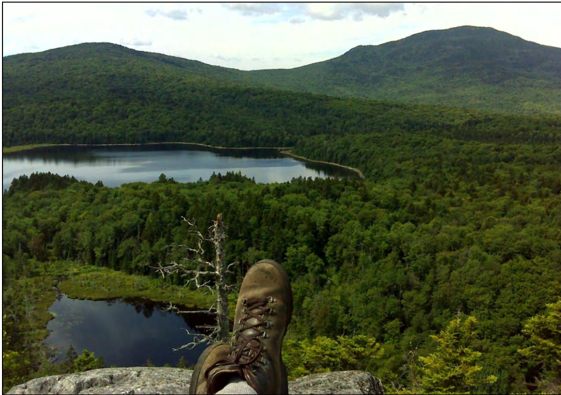
View from Hiking Trail Across Little Moose Unit

MAINE DEPARTMENT OF AGRICULTURE, CONSERVATION AND FORESTRY Bureau of Parks and Lands