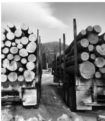
Timber Taken from Day's Academy Grant

Bureau staff closely supervise each harvest by providing loggers with strict harvesting criteria. These criteria specify which trees are to be harvested. In some cases, the Bureau will mark individual trees for removal, such as when there are high value stands, or other high value resources in special management areas having specific Bureau harvest protocols such as riparian areas or deer wintering areas. Also, when working with a new contractor, the Bureau may mark trees in a demonstration area. All harvest operations are inspected by Bureau staff on a weekly basis; more often when individual situations warrant.