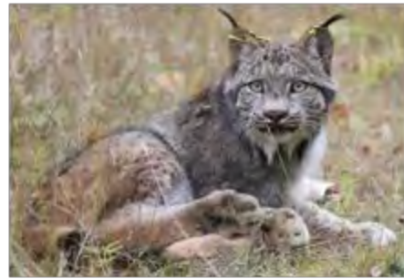
Canada Lynx

Lynx Habitat Management. The Bureau has entered into a Memorandum of Agreement with IF&W to manage a 23,000 acre portion of the Seboomook Unit for the federally threatened Canada lynx. The MOA describes management actions the Bureau will undertake during the 15 year term of the agreement such as timber harvesting activities that will maintain and enhance 6,200 acres of optimum habitat for snowshoe hare, the primary prey of lynx.