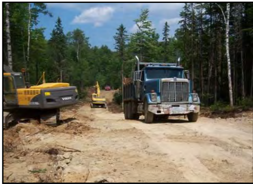
Management Road Construction at Nahmakanta

The Bureau continued to improve road access within its public lands, focusing primarily on recreational needs and implementation of its timber management program. There are currently about 275 miles of public use roads on Public Lands.