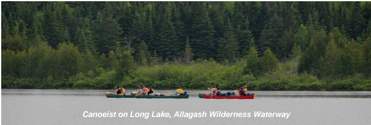
Canoeist on Long Lake, Allagash Wilderness Waterway

The commissioner shall report on or before March 1st of each year to the joint standing committee of the Legislature having jurisdiction over conservation matters regarding the state of the waterway, including its mission and goals, administration, education and interpretive programs, historic preservation efforts, visitor use and evaluation, ecological conditions and any natural character enhancements, general finances, income, expenditures and balance of the Allagash Wilderness Waterway Permanent Endowment Fund, the department's annual budget request for the waterway operation in the coming fiscal year and current challenges and prospects for the waterway.