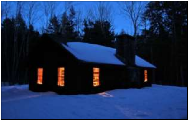
The original Ski Shelter was built as part of a federal recreation area.