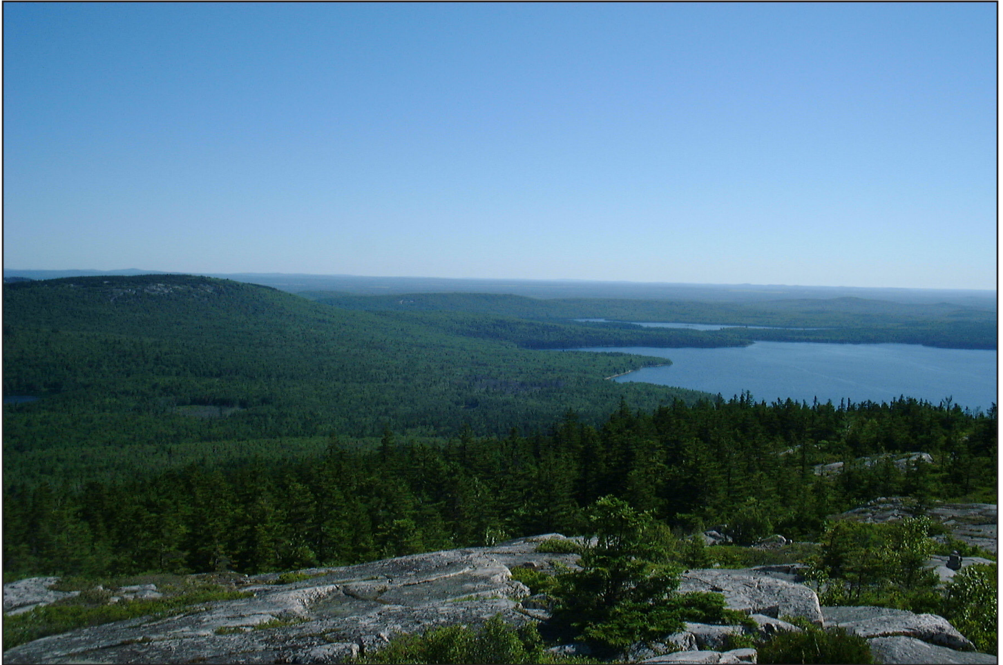
Eastward view of Tunk Lake from the summit of Black Mountain, Maine Natural Areas Program