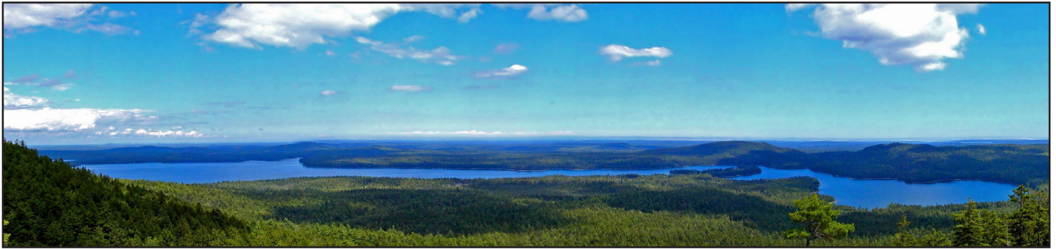
Tunk Lake from Black Mountain, Craig Snapp

blackburnian warbler, boreal chickadee, Swainson's thrush, red crossbill, and white-winged crossbill.