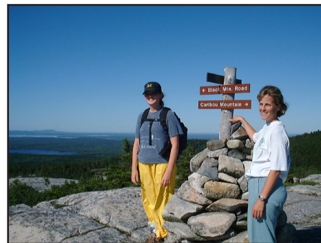
Summit Black Mountain, Maine Natural Areas Program

Lower-elevation Spruce - Fir Forest: These closed canopy (>75% closure) forests are dominated by red spruce (>60% cover), typically with few other tree species in any of the layers. Fir is often a minor canopy component (up to 20% cover), particularly in open gaps or in younger stands. Hemlock is occasionally mixed with the spruce in southern or central Maine. The lower layers are sparse or patchy, consisting mostly of tree regeneration. In the sparse herb layer, dwarf shrubs are virtually absent except for spotty lowbush blueberry; herbaceous species cover well under 10% of the ground surface, and usually consist of scattered plants of Canada mayflower, starflower, and bunchberry. Most of the ground surface is bare conifer litter, although at some sites (particularly Downeast Maine), bryophytes may form patchy to full cover. Broom-mosses are the most frequent and abundant bryoids.